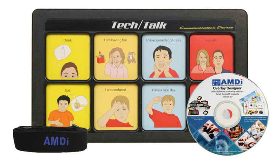
Fig. 4.1 Tech/Talk SGD. The Tech/Talk holds overlays of eight symbols/panels and has six different levels giving it a capacity for up to 48 digitized (recorded) messages. The Tech/Talk is produced by Advanced Multimedia Devices, Inc., Farmingdale, New York. Image used with permission

these 11 studies were generally positive in that most participants learned to use the SGD for performing the targeted communication skills. However, the review is limited in that it considered only adults with intellectual disability and one type of assistive communication technology (i.e., SGDs).