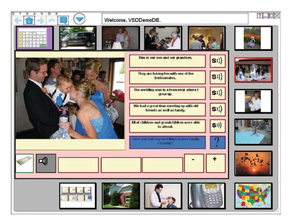
Fig. 2.3 Visual scene display. A hi-tech visual scene display provides contextualized images, written cues along with speech-generating technology to support communication. Adapted from Fried-Oken et al. (2012)

Additionally, the use of personally relevant, contextualized images may promote more accurate communication for individuals with ABI. This finding might be expected given that one of the communication deficits associated with an ABI is difficulty linking abstract images with meaning (Fox et al. 2001). By making these images more concrete and relevant to the individual's life, individuals may be more likely to connect those images with the corresponding words and descriptions and generalize their use to communication exchanges.