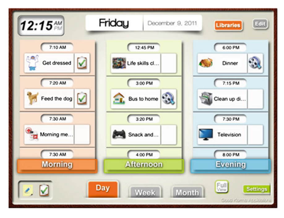
Fig. 2.2 Tablet calendar application. The visual schedule planner is an audio-visual tablet application which allows users to create and manage daily, weekly, and monthly schedules. The visual schedule planner is produced by Good Karma Applications, Inc., San Diego, CA

small portable devices in order to cue, or remind the user to complete specific tasks or attend appointments (Thone-Otto and Walther 2003). Such handheld devices can then deliver reminder messages using a variety of outputs such as voicemail, beeps, alarms, text messages, or visual cues. While the portability and lack of social stigma are benefits of handheld electronic devices, practitioners may find it necessary to program the device with a reminder message in the morning to alert the individual to utilize the device during their day (De Pompei et al. 2008) (Fig. 2.2).