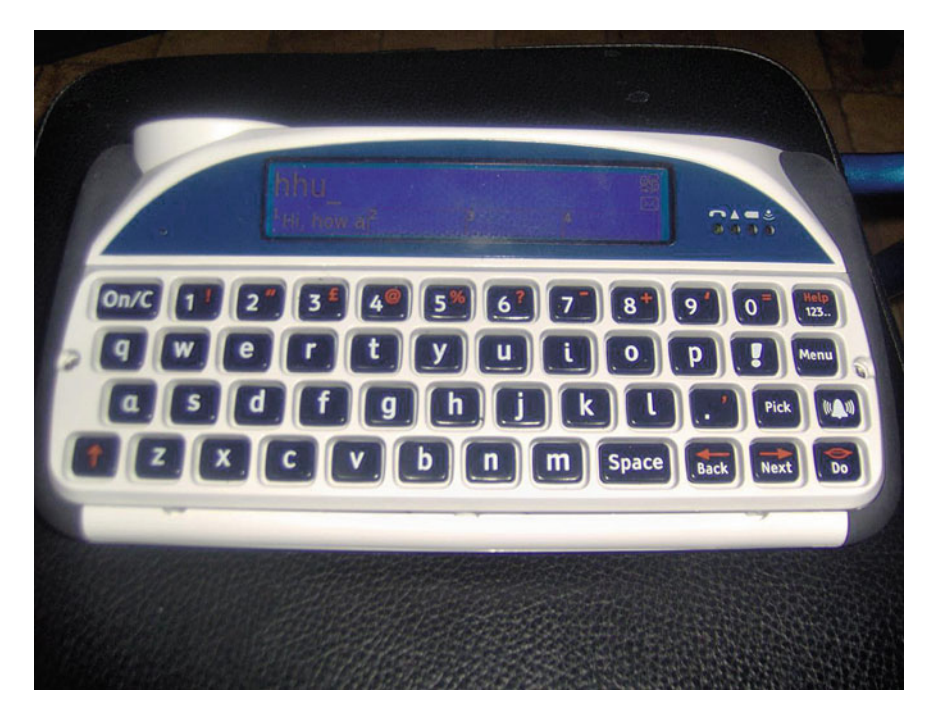
Fig. 4.3 Photograph of a LightWriter. The LightWriter is a text-to-speech SGD manufactured by Toby Churchill Limited in the United Kingdom (http://www.toby-churchill.com)