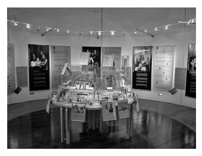
Figure 4.1 View of the Home Affairs exhibition as installed in the Apartheid Museum, 2008.

Within the Apartheid Museum, visitors found a circular exhibition space with one display going along the outer wall and another set up in the inner core (see figure 4.1). The outer circle tells the stories of seven South African families that challenge the white nuclear heterosexual