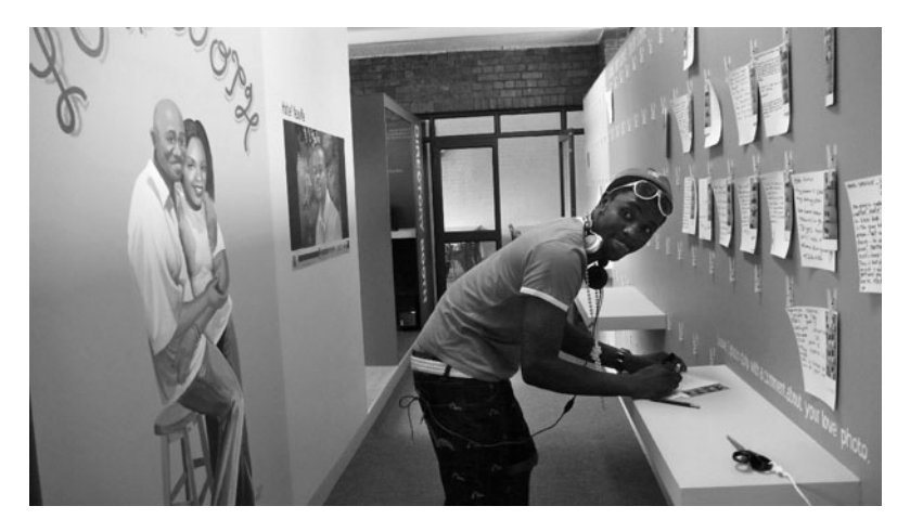
Figure 4.3 "Hotel Yeoville visitor adding his image to the photo wall." Photograph of the Hotel Yeoville exhibition, 2010.

these stories within the Yeoville community. Such processes of intimate exposure—a term that Kurgan has actively embraced (30)—here become a kind of "glue" meant to "stick" members of a distressed and diverse community together, as they allow space for migrants to create affirmative representations of themselves and for migrants and others to engage with, or to respond to, them. "A utopian attempt to bind a community through a kind of inventory of personal and collective relations," as Kurgan describes Hotel Yeoville ,