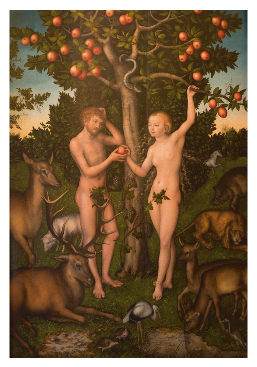
Fig. 1 Lucas Cranach, Adam and Eve at the Fateful Moment of the Temptation.