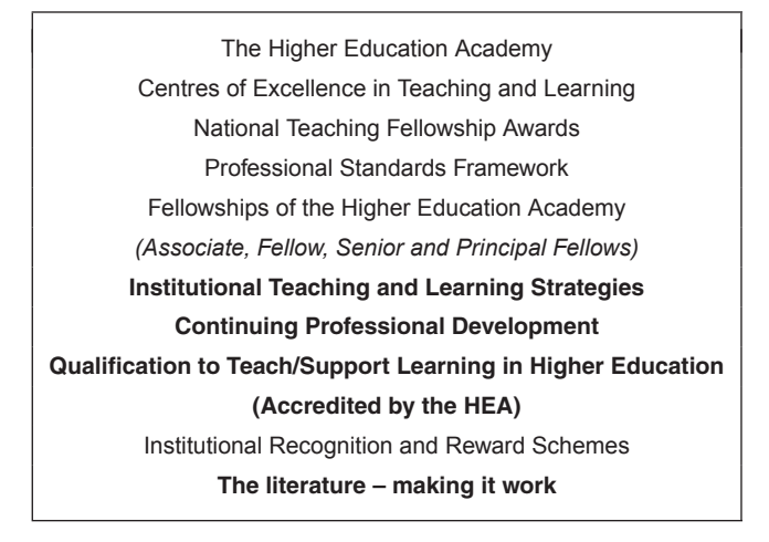
Figure 8.1 The discursive formation of higher education constructed by the National Committee of Enquiry into Higher Education Report (1997)

and structures. Is it then our responsibility as teachers to make our students aware of the subjectivities that prevailing discourses promote, as well as the alternatives and paradoxical implications of them? By so doing can we help our students negotiate the complexities of 'being' in a postmodern condition (Bauman, 2000)? The extent to which the subjects of the discourses of higher education (myself, colleagues, students) claim or resist (Burr, 2003) the subjectivities put forth by these discourses became the focus of my literature review.