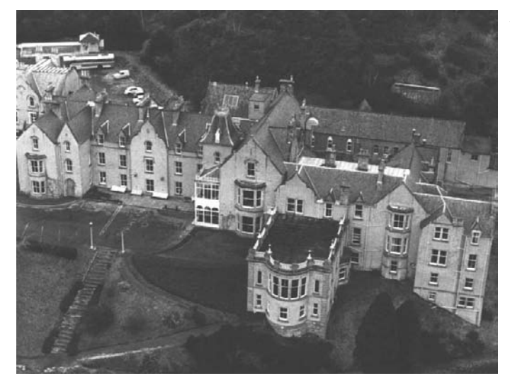
Aerial view of Cluny Hill Hotel.