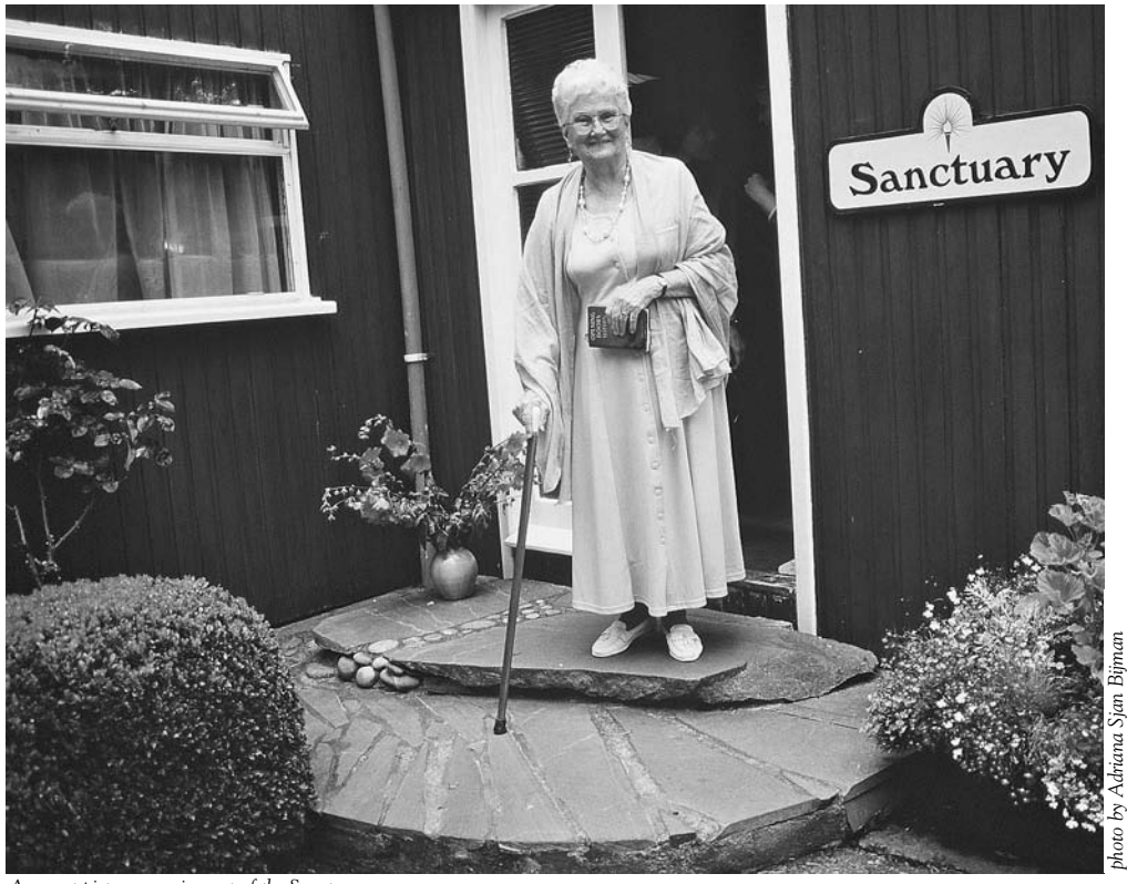
A recent picture, coming out of the Sanctuary.