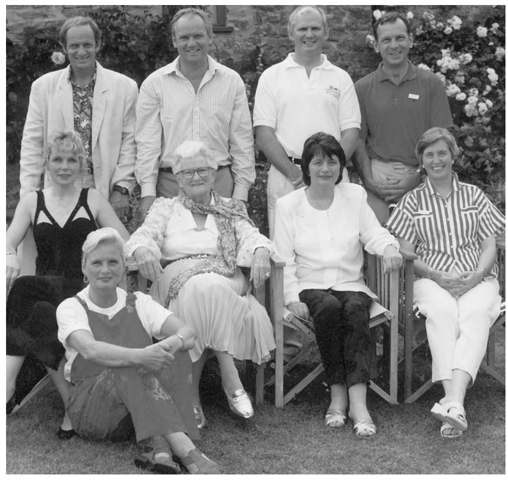
With all my eight children, together for the first time ever, to celebrate my 80th birthday in 1997.