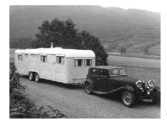
Our caravan and Lagonda car.