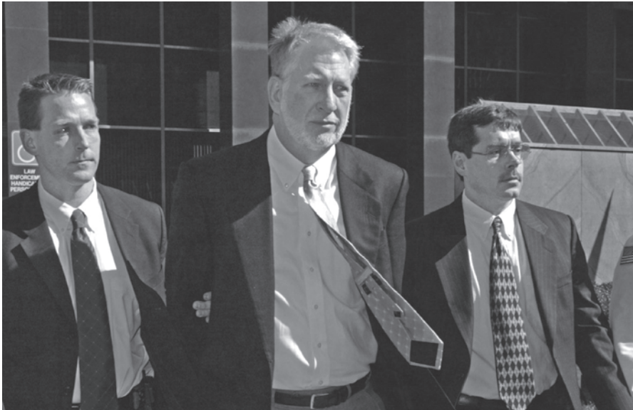
Bernard Ebbers. The head of WorldCom is given his “perp” walk for the benefit of the press.