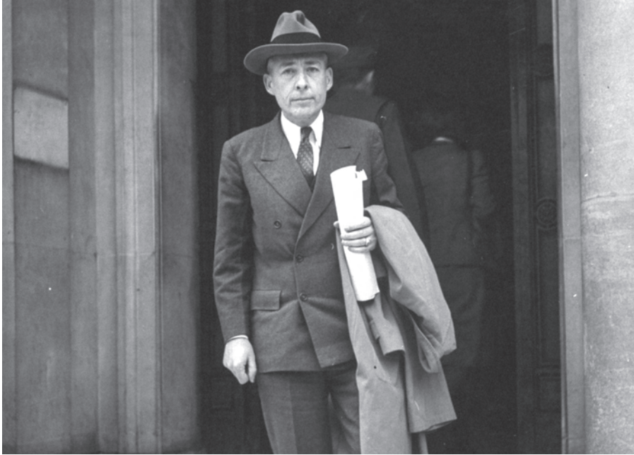
Adolf Berle. The Columbia law professor who led the assault on large corporations and their management.