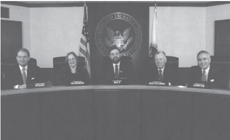
Harvey Pitt (seated in the middle). The hard-working SEC chairman who became another target of the hysteria surrounding Enron. Seated to the right of Pitt is Harvey Goldschmid. He undermined Pitt and served as Arthur Levitt's surrogate on the SEC.