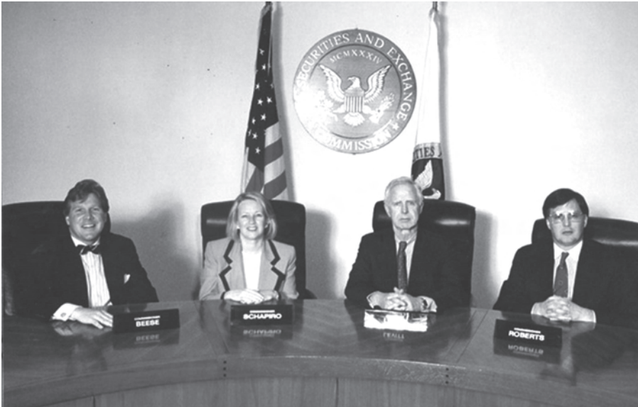
Arthur Levitt (second from right). He became a full-disclosure gadfly after the massive scandals that arose on his watch as an activist SEC chairman.