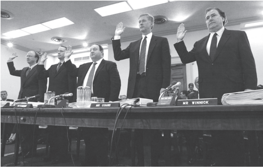
Gary Winnick (on the far right). The founder of Global Crossing and former confidant of Michael Milken.