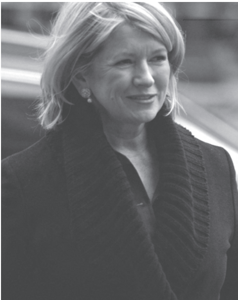
Martha Stewart. Her success made her a target for government entrapment.