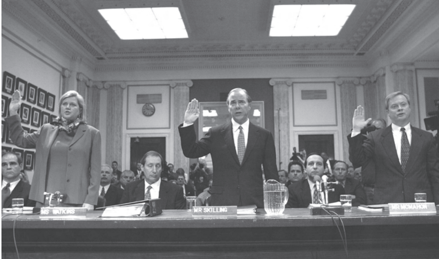
Jeffrey Skilling and his accuser Sherron Watkins (side by side). Skilling's resignation touched off the events that led to the collapse of Enron.