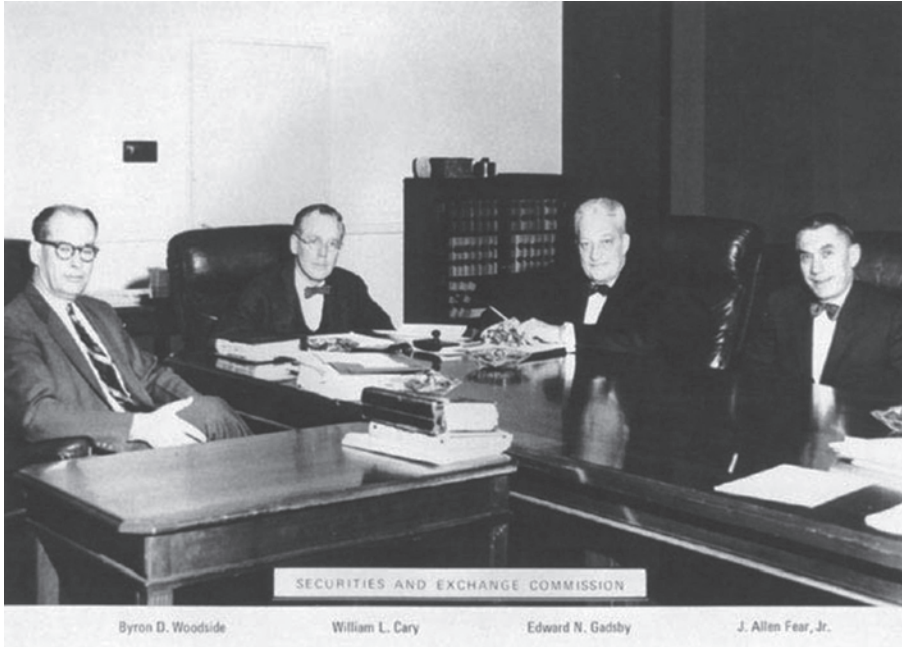
William Cary (second from left). This activist SEC chairman created the crime of insider trading.