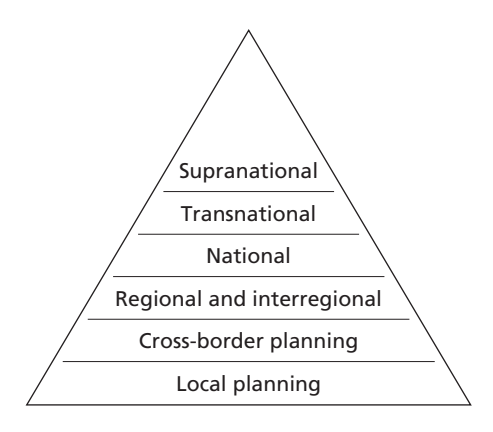
Figure 13.1 Typology of scales of EU spatial planning

Supranational planning is perhaps the easiest to define of the non-domestic scales of planning. It refers to planning for the territory of a group of countries as a whole. It has, of course, attained a high EU profile with the Europe 2000 and Europe 2000+ documents (CEC 1991, 1994) and with the European Spatial Development Perspective because the European Union is a jurisdiction. However, the latter condition does not necessarily have to be met. Work by the Council of Europe on the European Spatial/Regional Planning Schema in the 1980s (see Williams 1996: 79–80) is also an example of supranational planning, as was the 1991 Perspectives in Europe study by the Dutch government (RPD 1991; Williams 1996: 86–7). The spatial scale