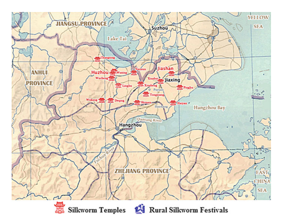
Fig. 7.2 Distribution of temples from Qianlong Reign (1736–1795) onward

noted, silkworm festivals were originally rural people's rituals, but city-folk became increasingly involved, especially for entertainment. After 1750, nearly every town in Huzhou and Jiaxing had a silkworm temple, often located within the temple to the City Wall God or to the Yellow Emperor. In Jiashan County, for example, the temple to the Ancestor Silkworm was moved from an ancestral hall outside the city to a Daoist pavilion within the city proper.