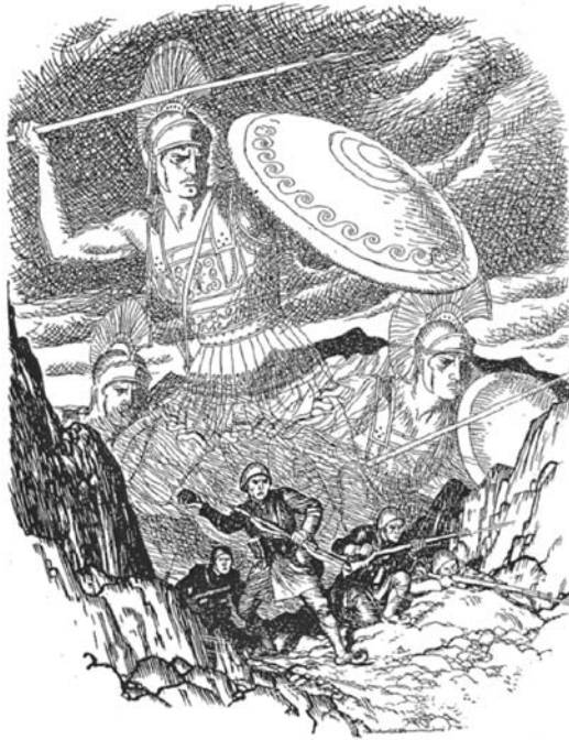
Figure 8.1 On October 28, 1940, following an Italian ultimatum, Greece refused to concede to Fascist occupation. The victory of the Greek forces against Mussolini's legions inspired the victims of Axis aggression in the darkest hour of Europe. Punch magazine celebrated Greek defiance with this cartoon

Finally, in January 1940, a definitive war trade agreement was signed between the two countries, as well as a shipping agreement, by which the Greek ship-owners undertook, with the encouragement of the Greek government, to provide Britain with 31 ships and to ensure that another 29 would be put forward, amounting to about 500,000 tons.