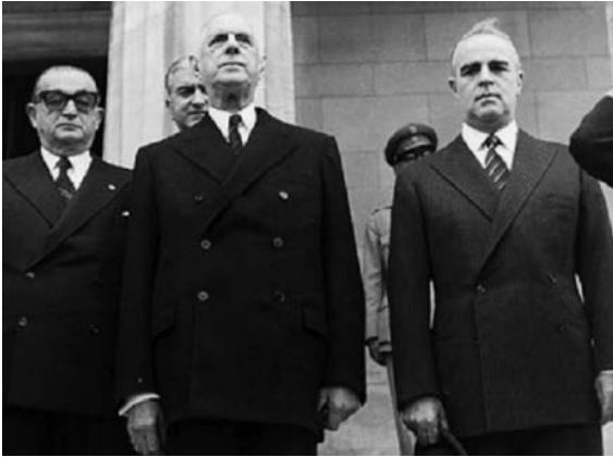
Figure 10.1 President Charles De Gaulle of France met with Greek Prime Minister Constantine Karamanlis in Athens, on May 16, 1963. The visit was part of an effort to divert Greece's exclusive relationship with the NATO powers

electoral law did so even more. The true benefit of the 1956 elections, however, was reaped by the Left which broke out from its ostracism and was legitimized in its partnership with the center forces. Henceforth the Left would merge its own rhetoric with the anti-right parlance of the liberals. 6