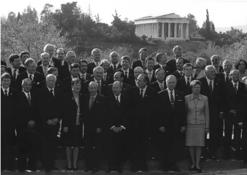
Figure 12.2 The 2003 European Union summit in Athens. Greek Prime Minister, Costas Simitis, in the middle of the first row, brought Greece into the Economic and Monetary Union in 2002

the barren islet of Imia which is part of the Dodecanese complex and hoisted a Turkish one in its place. Greek soldiers replaced the Greek flag and the incident was deemed as innocuous by the Greek foreign minister Theodore Pangalos until the then Turkish prime minister Tansu Çiller herself laid an official claim on the islet and began a confrontation that almost led to war. The crisis was defused through US mediation but a claim on territory was added to the overburdened agenda of Greek–Turkish problems.