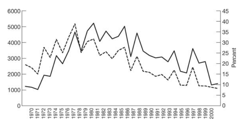
Figure 4.1 World Bank (IBRD+IDA) assistance to agriculture (1970–2001)

The bank's historians have followed the path of the bank's agricultural assistance over the past four decades.<sup>13</sup> As they put it, for an institution that in the 1970s would become agriculture's most active and generous official international promoter, the bank got off to a slow start. In the early days, before IDA, Eugene Black, the bank's president