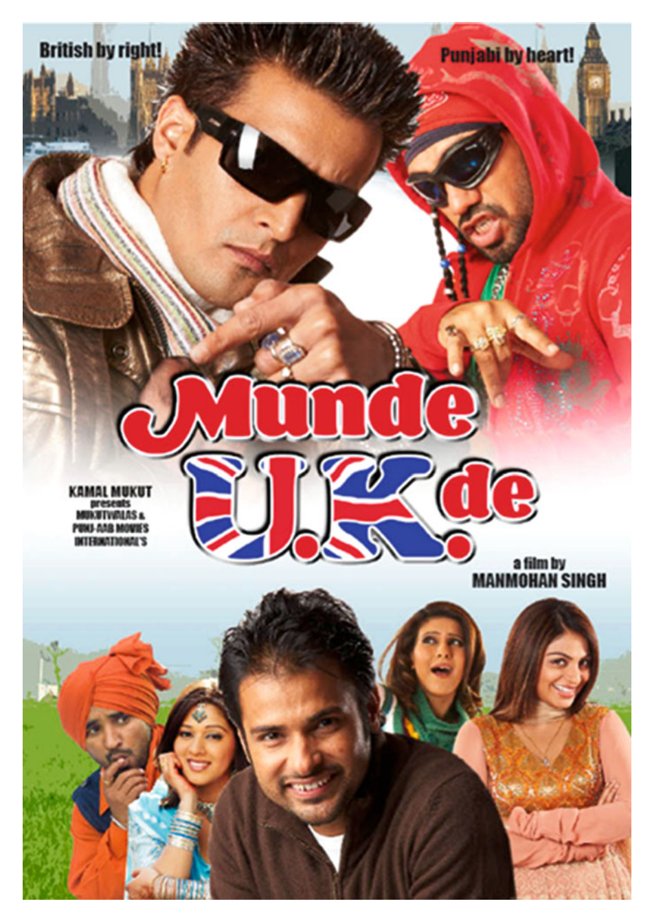
Fig. 2.3 Film poster for Munde U.K. (Source: De 2009)