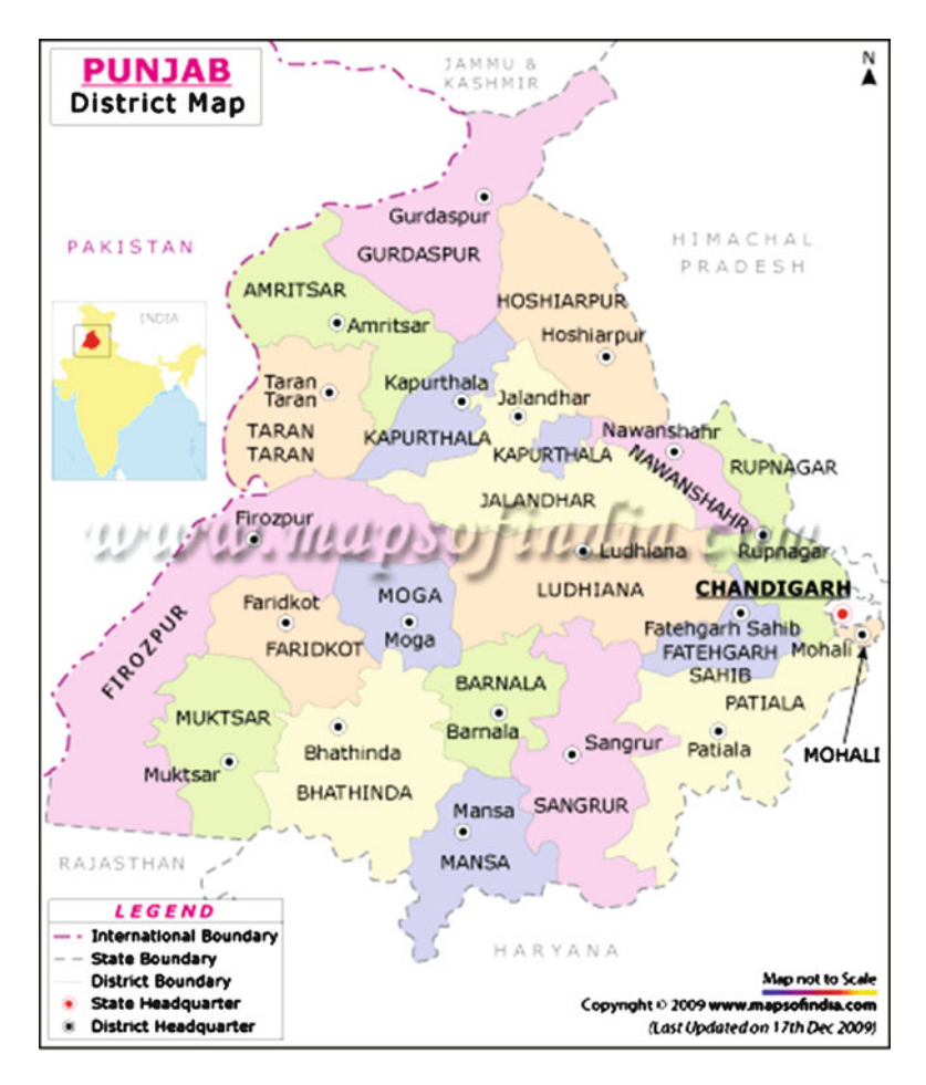
Fig. 2.1 District map of Punjab