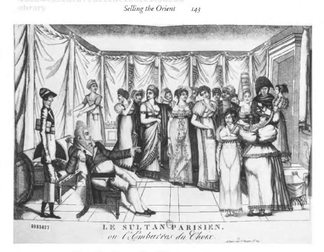
Figure 6. Le sultan parisien, Bibliothèque nationale estampes

ception was not completely false because many of the key ingredients to cosmetics were originally imported from the Near East. The French had long prized the perfumes and minerals that originated in the Ottoman Empire, though the shift in trade away from the Mediterranean and toward Asia in the late seventeenth and eighteenth centuries diminished these imports. Whether from the Ottoman Empire or further afield, exotic goods used for beauty—such as cochineal (from Goa), vermillion (from China) cinnabar, tartar, musk, rose water (from Persia), grey amber, and carmine, as well as countless spices-were shipped to French ports to be disseminated throughout the country and then packaged for consumption by apothecaries and grocers.<sup>34</sup> The ingredients' rareness led to the creation of populuxe copies that could be sold more cheaply and widely. Though French critics accused unscrupulous Muslim merchants of adulterating their goods to dupe naive French buyers, local artisans probably did most of the falsifying.<sup>35</sup> Affordable goods from Turkey or Egypt, whether or not fully authentic, entered the homes of consumers through the ingenuity of peddlers or local retailers who sold promises of beauty alongside cheap Oriental tales.