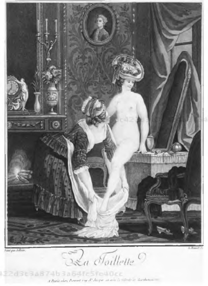
Figure 5. Louis Marin Bonnet, La toilette, d'après Jollain (1781), Bibliothèque nationale estampes

gaze) impeded direct access to the nude. The hat and the artifice of hairpiece and rouge negated the purity of the body, reminding the viewer of the constant playacting, intrigue, and deceit involved in Old Regime seduction. The hat, makeup, and wig's disappearance erased potentially difficult, and more equal, games of badinage, leaving the new woman and her passive beauty immediately accessible to the menwho gazed upon her.