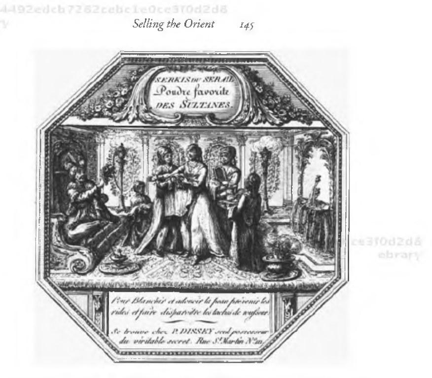
Figure 7. Serkis du sérail, Dissey et Piver, Bibliothèque nationale estampes

Eau de sultane asserted that its recipe was stolen from the harem by an officer of the seraglio, presumably a eunuch, and sold to a French sailor in Constantinople.<sup>44</sup>