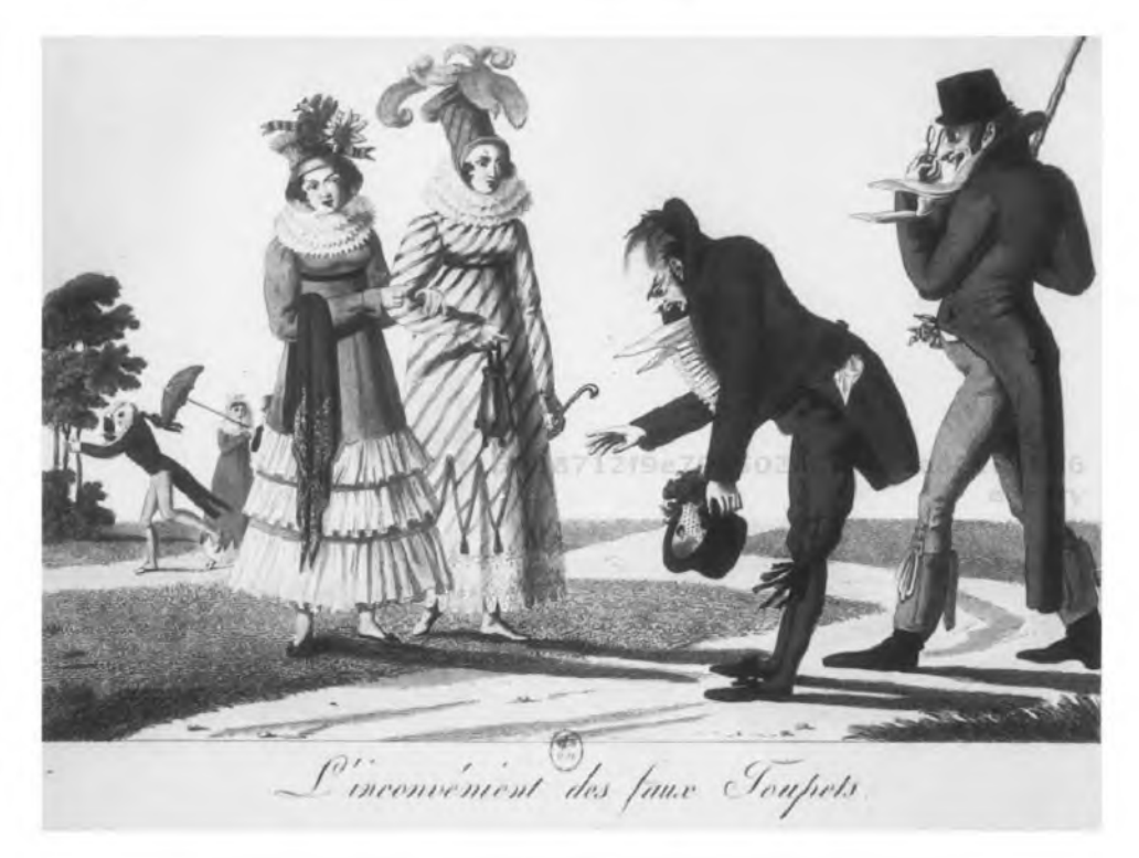
Figure 10. L'incovénient des faux toupets

choices were tricky. If they adopted a wig, it signified stodginess and it might fall off inopportunely, but if they wore their naturally thinning hair, they were also left defenseless in a world of new signs.