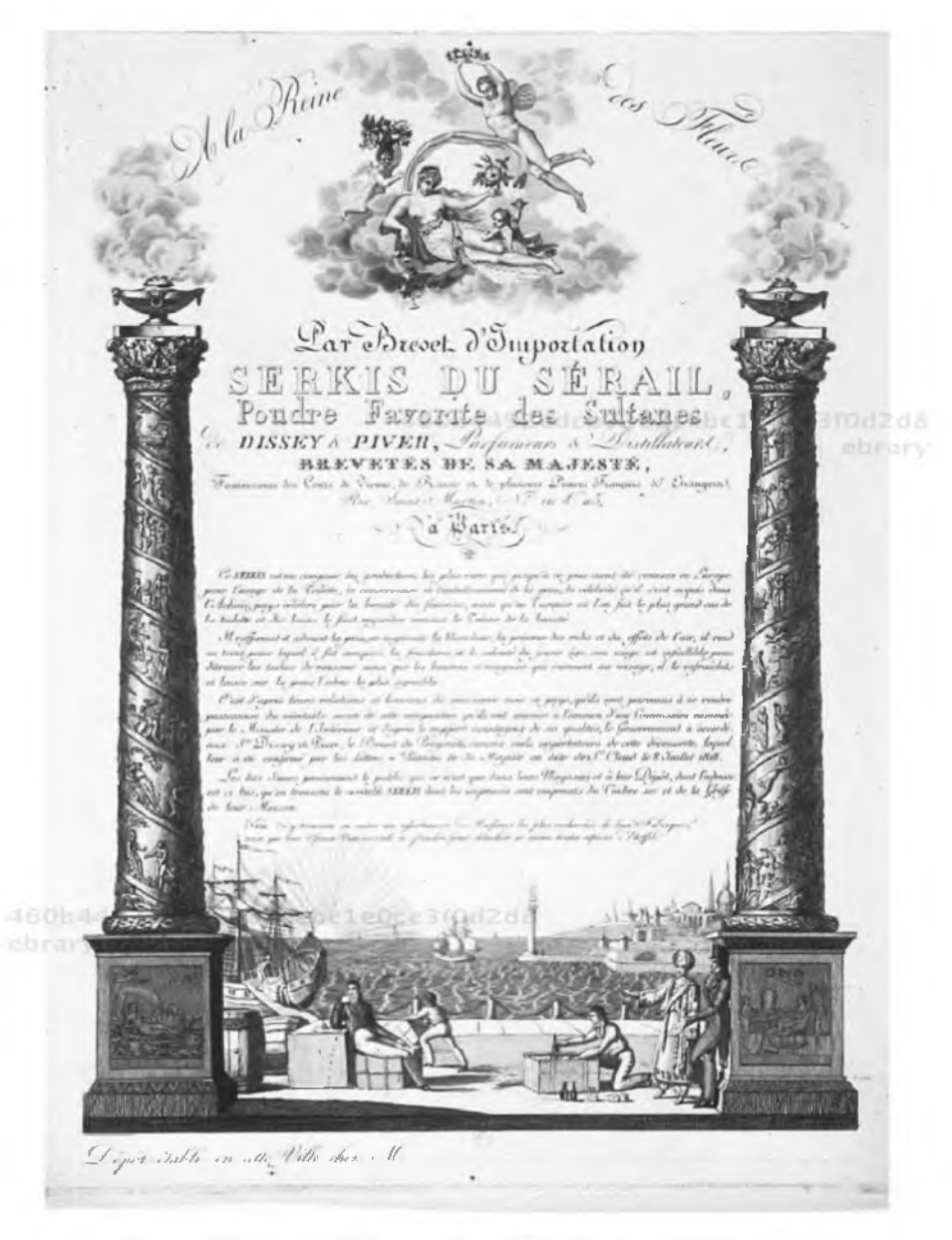
Figure 8. Serkis du sérail, Dissey et Piver, Bibliothèque nationale estampes