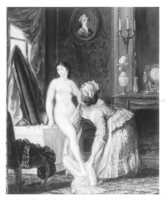
Figure 4. René Nicolas Jollain, La toilette, Musée Cognacq-Jay