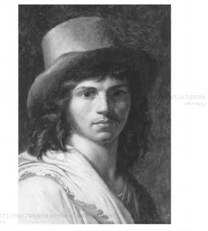
Figure 12. Anne Louis Girodet De Roussy-Trioson, Self Portrait (1795), Réunion des musées nationaux/Art Resource

545871219979b502a09ece7aa2ca8996 ebrary Conclusion 181