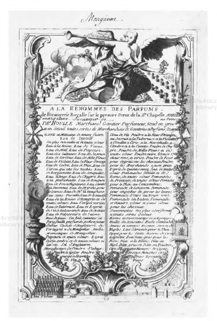
Figure 2. À la renomée des parfums