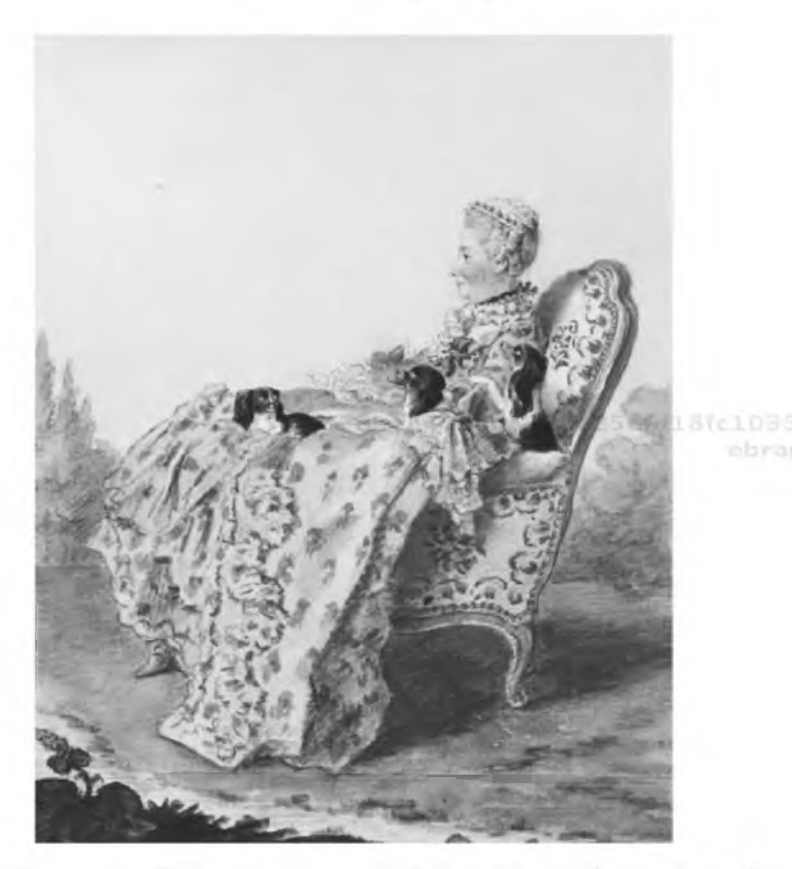
Figure 1. Carmontelle, Madame la comtesse de Rochechouart (1759)

group. Some wear no distinctive color, while others sport shades of pink along the cheekbone of a tanned face. Those in court dress are more likely to be depicted with rouge than those in less formal garb.<sup>110</sup> Overall, paintings of the royal family, aristocracy and bourgeois elite by a variety of artists generally depict them as wearing round daubs of color, from orange to pink, with little bright red represented. These portraits emphasize the uniformity of paint among the elite, while downplaying the extreme color and stripes described by commentators.