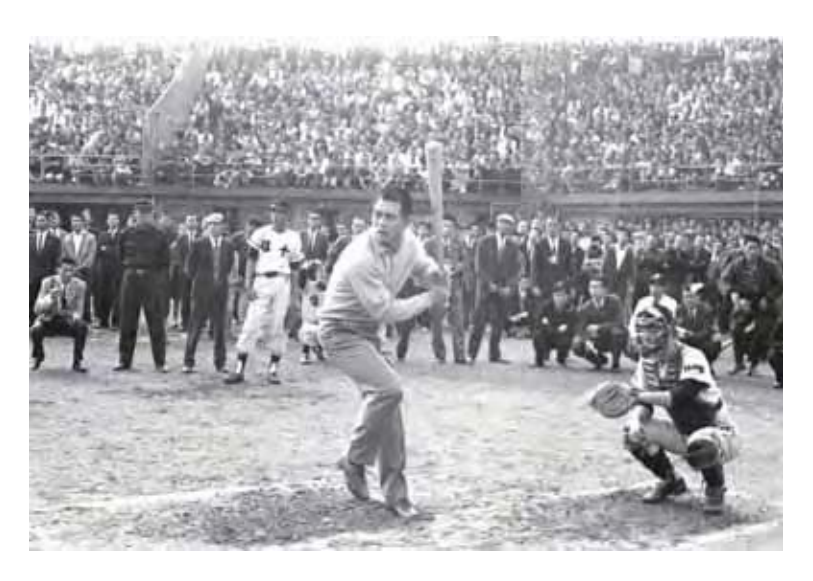
9. Sadaharu Oh exhibits his offensive power in front of a packed crowd in 1965.