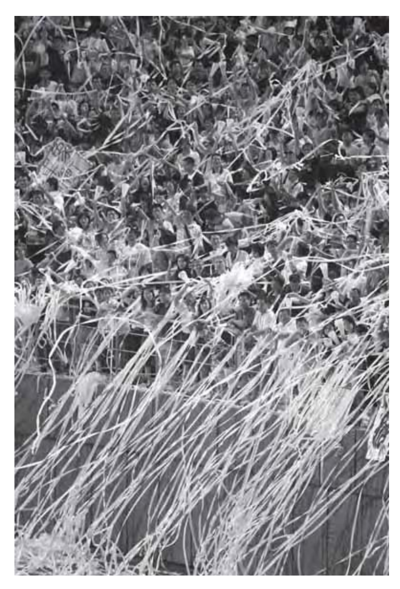
17. Fans cheer for Brother Elephants, the most popular team on Taiwan.