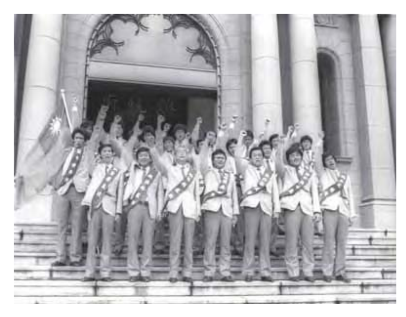
14. The national team and staff are shown here shouting patriotic slogans in front of Presidential Hall after the 1983 Asian Championship campaign.