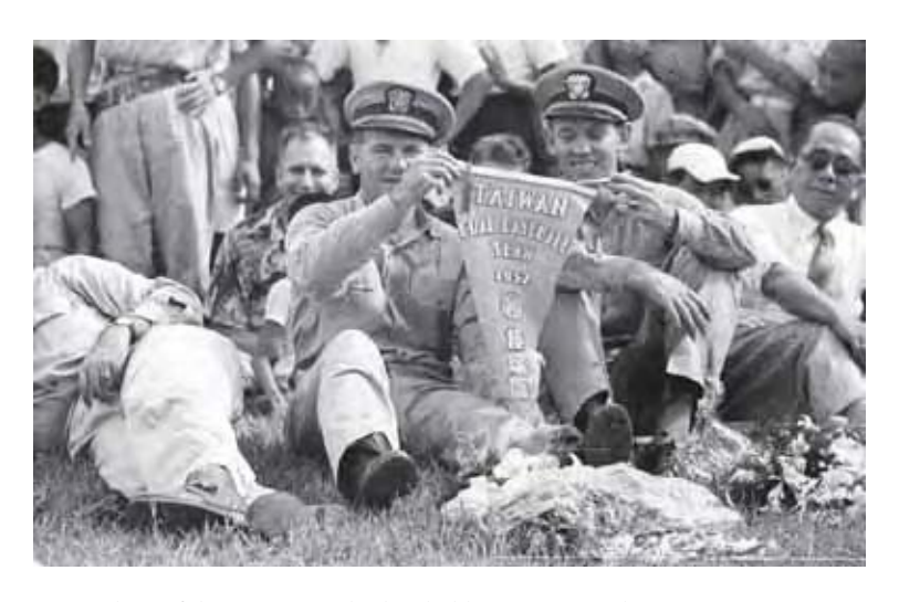
4. Members of the U.S. Seventh Fleet hold up a souvenir banner given to them by the Taiwan Coal baseball team during a visit to Taiwan in 1952.