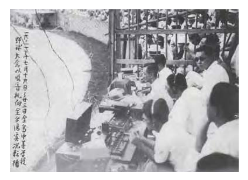
1. Staff and reporters used radio to broadcast games to all of Taiwan during the Japanese occupation.