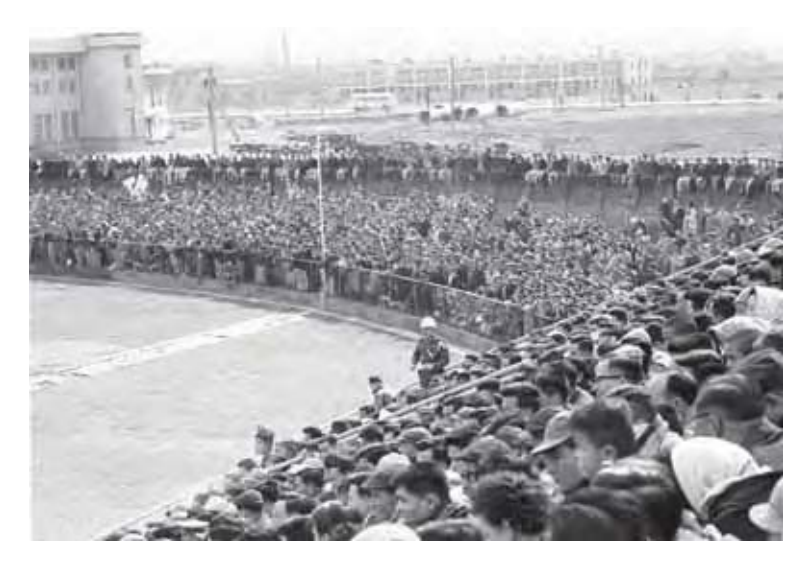
8. Taiwan hosted the Fourth Asian Championship, at which fans were packed so tightly into the partially completed Taipei Municipal Stadium that many had to sit on the wall.