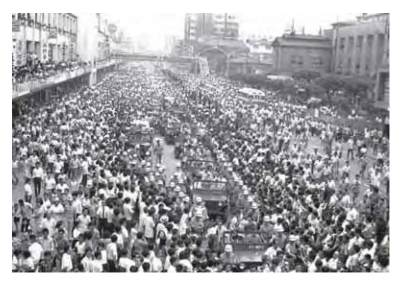
13. A victory parade was held in downtown Taipei after Juren won the LLB world series in 1971.