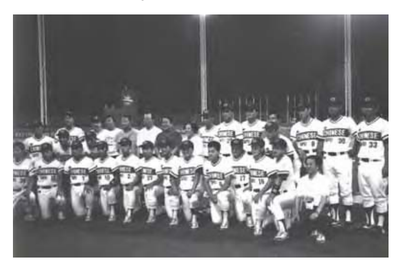
15. The 1992 Olympic squad that won the silver medal in Barcelona.