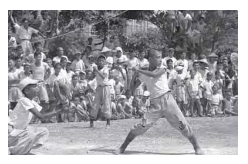
6. Wearing simple T-shirts and torn trousers, young Taiwanese play baseball barefoot during the 1954 Children's Cup.