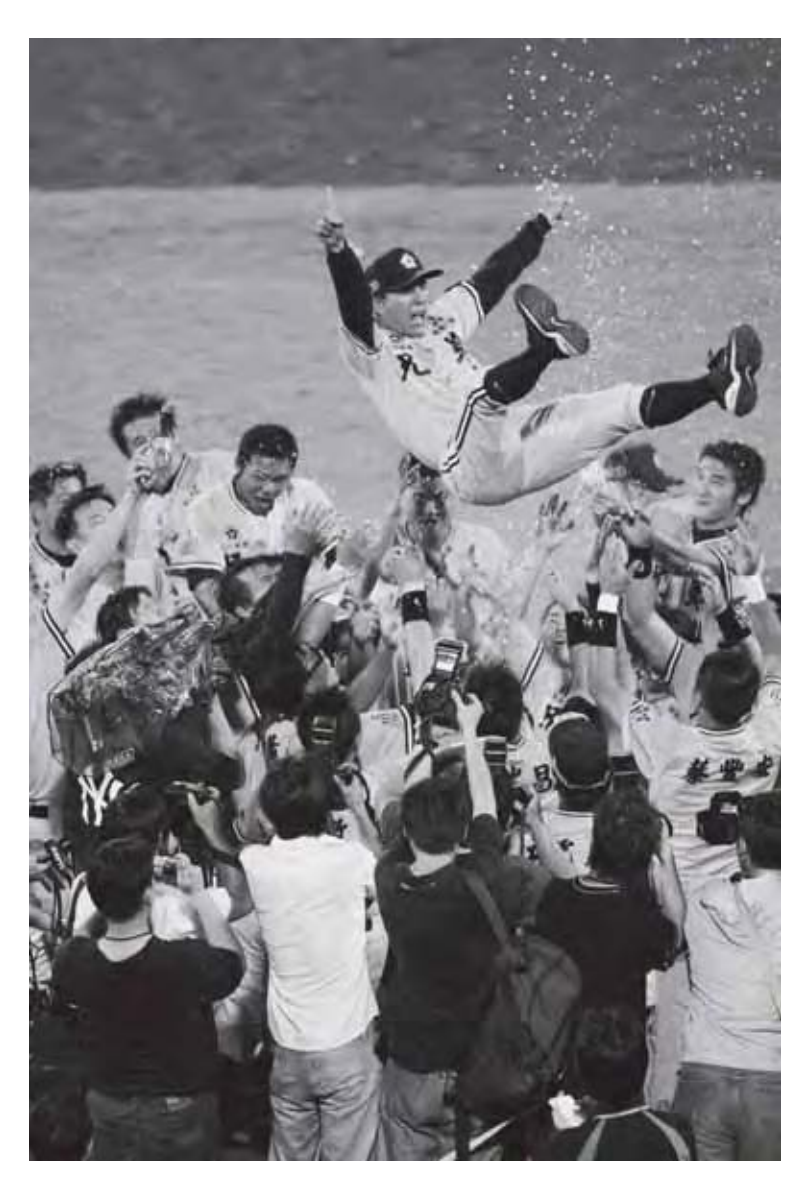
18. The Brother Elephants celebrating their second-half season title in 2003.