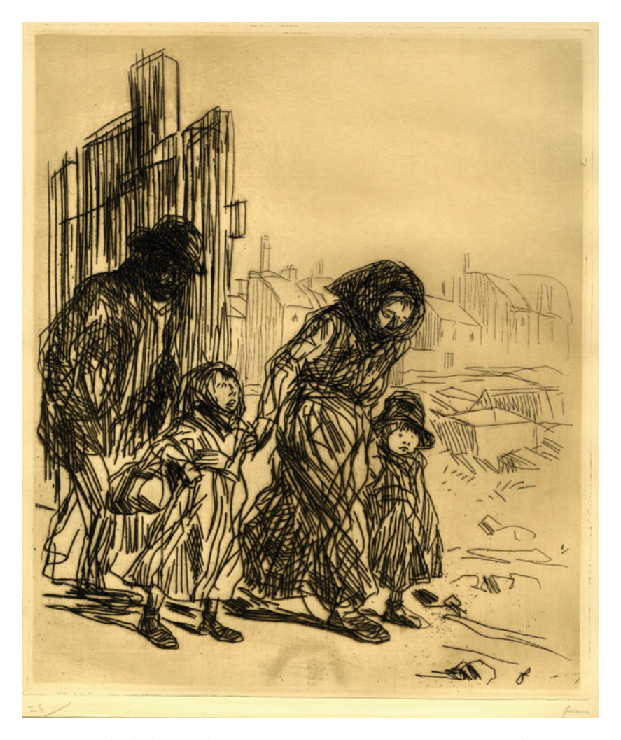
Fig. 11.1 Après la saisie by Jean Louis Forain, circa 1870–1900.

ment. The idea that parents need to be supported to engage productively with medication serves to compound identification of social classes with specific medical problems and, thereby, medicalizes their experiences of poverty. Being poor and working class can, therefore, mean that child