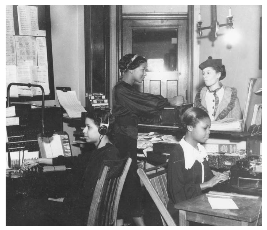
The Negro Youth Administration generally provided more equitable training for black and white young people. In this 1936 photo, young black women who have received clerical training are paid by the NYA to work at an Illinois branch of the "Colored" YWCA. Chicago, IL, 1936, Courtesy of the Franklin D. Roosevelt Library Digital Archives.

Bethune also used the agency to coordinate broader efforts on behalf of African Americans. For example, she organized two widely attended confer-