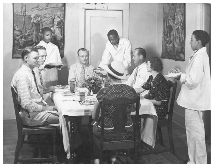
The Works Progress Administration often provided job training for African Americans in fields that fit white officials' idea of what jobs were appropriate or available for black workers. Here, young men attending a WPA training class in Arizona in 1936 serve the white WPA and U.S. Employment Service officials posing as diners.

Elsewhere, particularly in the South, local white leaders continued to hire black workers only for menial labor positions regardless of their actual skill level or the availability of skilled positions. Others simply refused to hire any black people at all so long as there were white people in need of work. Access to WPA jobs was even more limited for rural black southerners. The WPA's internal hiring practices reflected the same patterns. While African Americans obtained administrative positions in many northern cities, of the more than 10,000 WPA supervisory officials in the South, only 11 were black.