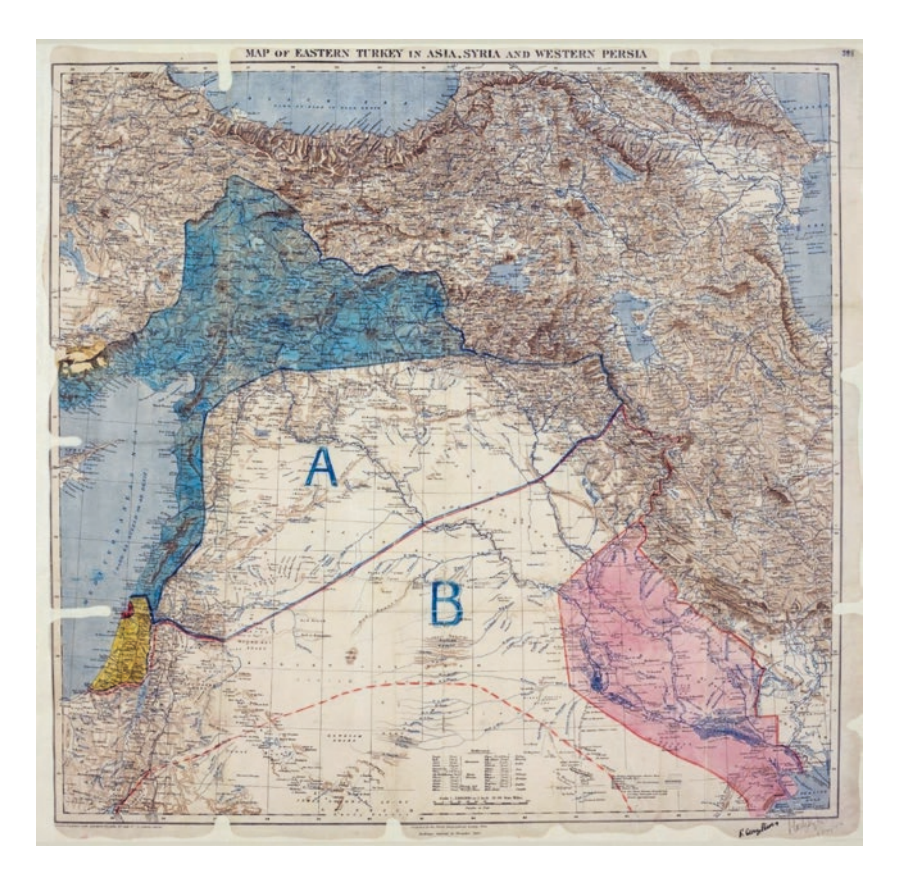
Fig. 5.4 Map of the Sykes–Picot agreement, signed 8 May 1916, MPK 1/426, The National Archives, Kew, UK

Given the major differences between the Arab and Jewish nations in the minds of British and French policy-makers alike, it should not be surprising that the turn to the Semitic as a political idea was not a reflexive response to the possible disappearance of the Ottoman imperial state. After the British correspondence with Hussein in late 1915, Sykes and Georges Picot signed in May 1916 what became their infamous plan for the region in the event of an Ottoman defeat. The Sykes–Picot agreement (Fig. 5.4) divided Western Asia into a blue area under French authority; a red space in British hands; zones A and B, which were to be independent