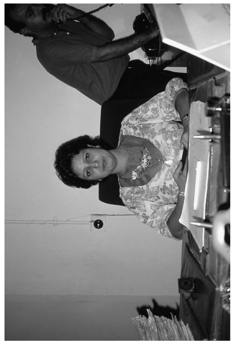
Figure 1. Adeni family court judge in her court with her assistant, early 1990s. After Yemini unification, women were no longer allowed to head a family court or to train as judges.