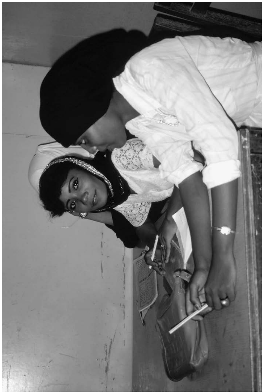
Figure 5. Participants of a literacy class run by a local club of the General Union of Yemeni Women during the late years of the People's Democratic Republic of Yemen.