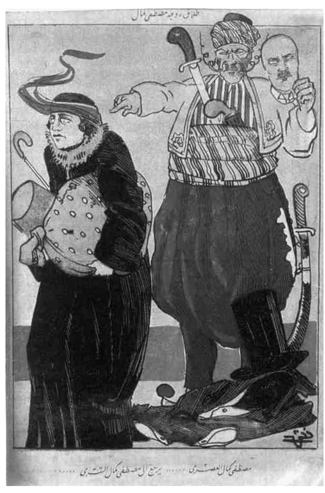
Figure 6. Khayāl al-zill (Cairo: n.d.), vol. 2, no. 62, Sunday, 23 August 1925, p. 16.