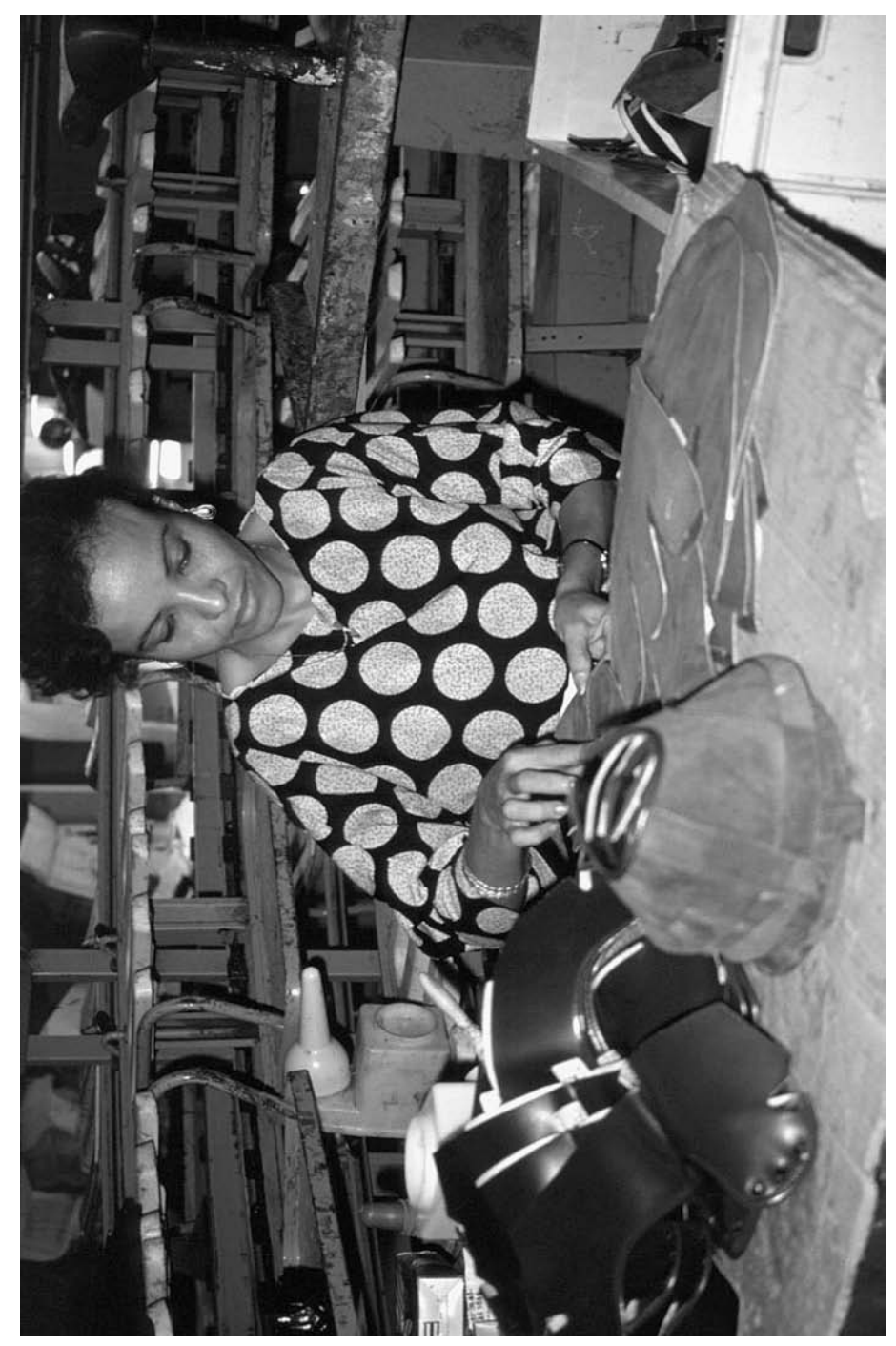
Figure 4. A factory worker in the Leather Shoe Factory, Aden. During the early years of the People's Democratic Republic of Yemen, literacy was a requirement to enter factory work. The photo is from 1989.