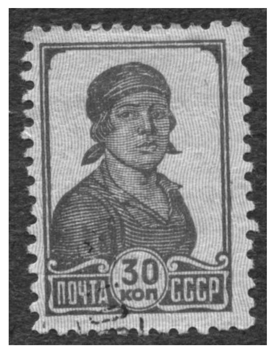
This postage stamp and the one on page 286 depict women workers. The stamps were issued from 1929 to 1931 as part of a set featuring two women workers and two collective farmers. They were issued as regular or definitive, not commemorative, stamps, and were reissued from 1937 to 1952. The stamps reflect the importance the state attached to the role of women workers during the 1930s.