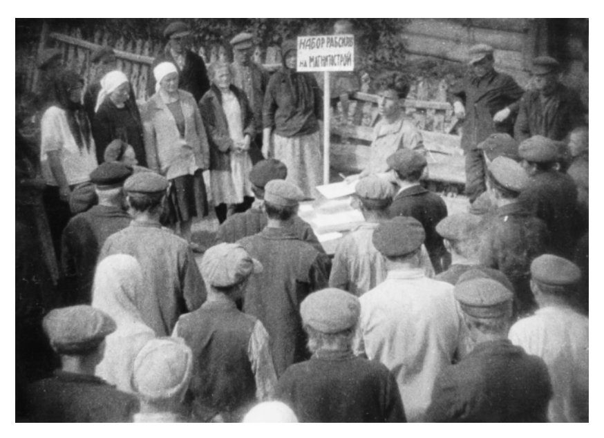
A village meeting to recruit new workers for Magnitogorsk. 1931.