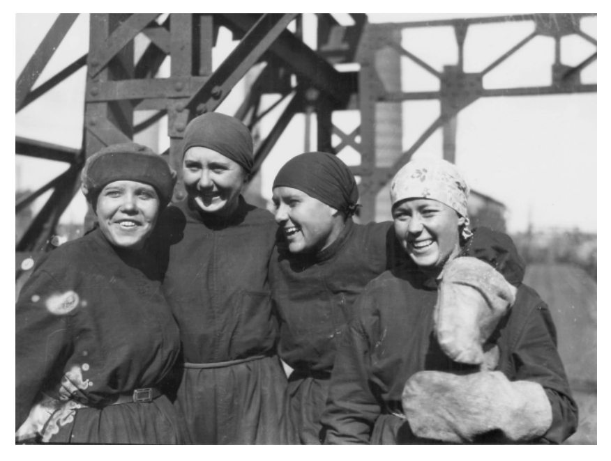
A group of record-setting women workers (udarnitsy) in mining. 1931.

The regendering strategy used by both large- and small-scale planners had profound implications for women's place in the labor force. It helped to move women into the labor force en masse, but it did not advance the idea of gender equality. Even when new opportunities opened up for women in heavy industry, the jobs remained largely segregated by sex. Moreover, the creation of a mainly female, low-waged service sector had its origins in the plans initially developed by NKT and Gosplan in the late spring of 1930. Thus the very strategy of moving women into the labor force, to give them economic autonomy and independence, staked its strength, efficiency, and success on the deliberate drawing of the boldest, sharpest lines ever to delineate "male" and "female" work.