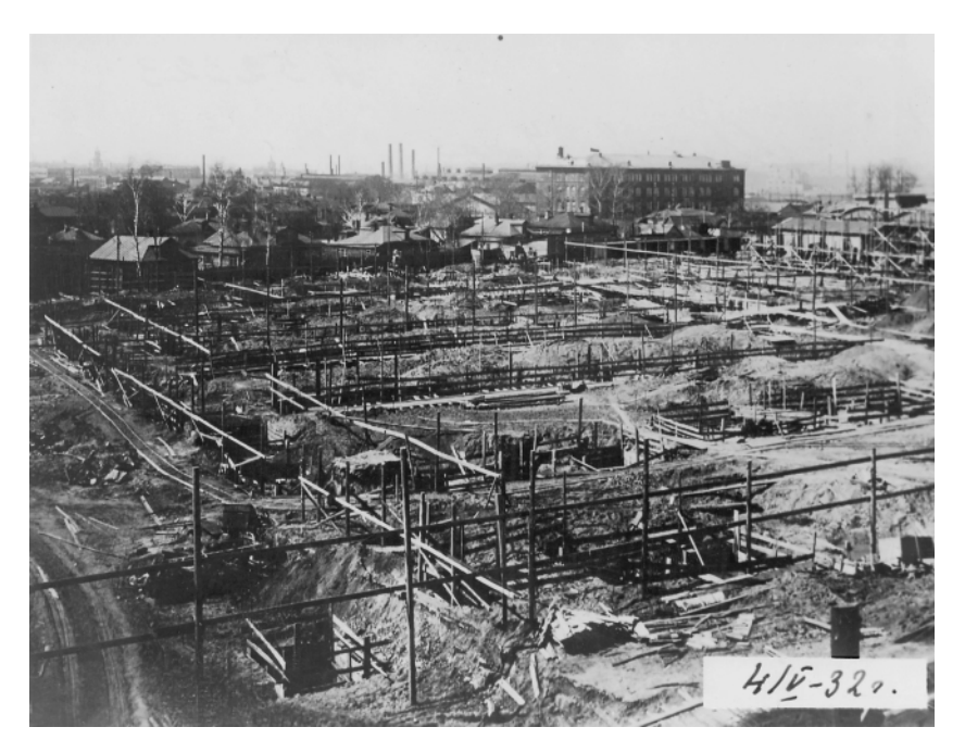
Construction at Serp i Molot (Hammer and Sickle), one of Moscow's largest metallurgical complexes. 1932.