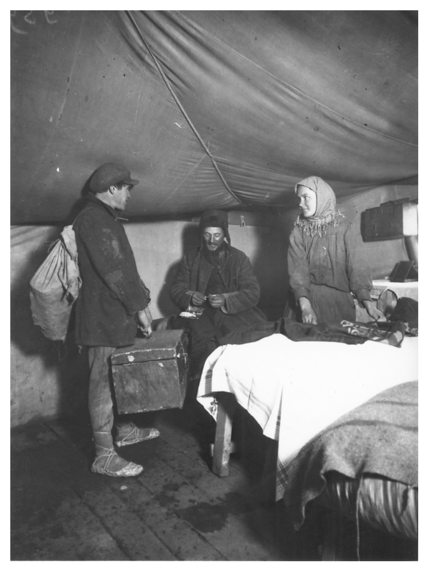
A woman dormitory worker makes a bed in a crowded tent for a peasant new arrival at Magnitogorsk. 1931.