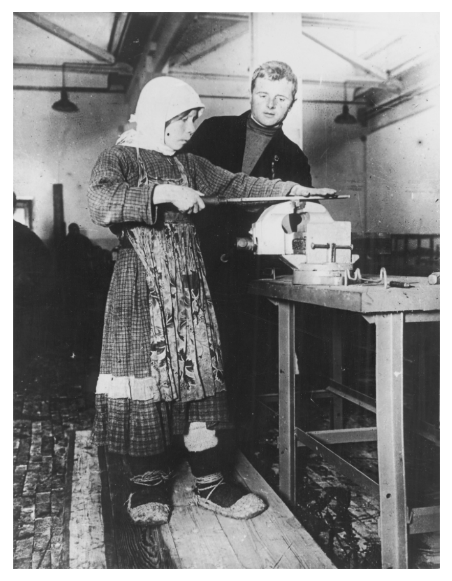
A male member of the Komsomol (Communist Party Youth Organization) teaches metalworking to a young female collective farmer. Note the girl's homemade bast sandals. 1930.