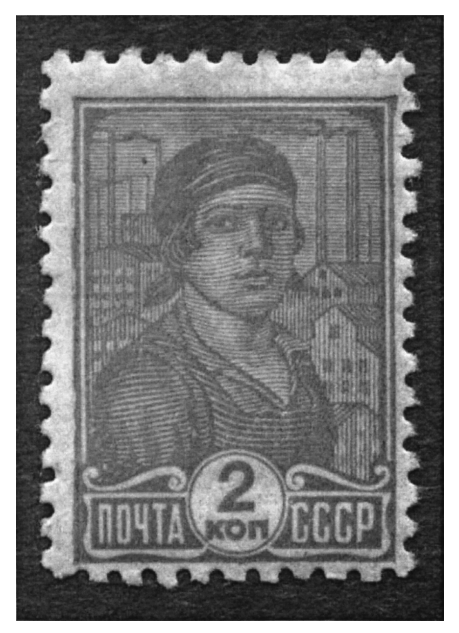
Postage stamp of a woman worker with the factories' smoking chimneys behind her. Issued from 1929 to 1931.