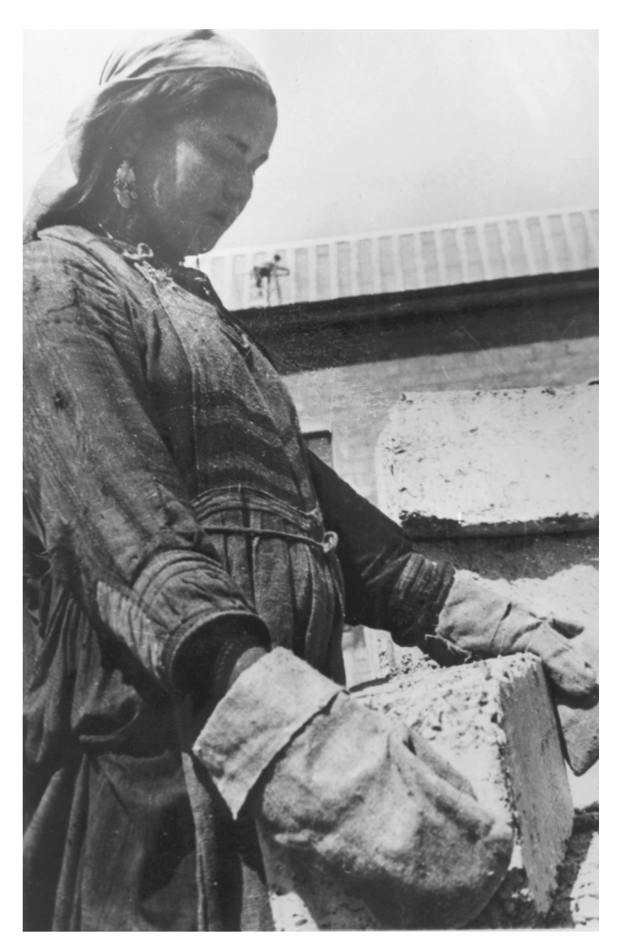
A woman worker hauls stones at Ural'mashstroi, a construction site for the Urals machine-building factory in Sverdlovsk. This work was typical of the unskilled labor performed by women on construction sites. 1931.