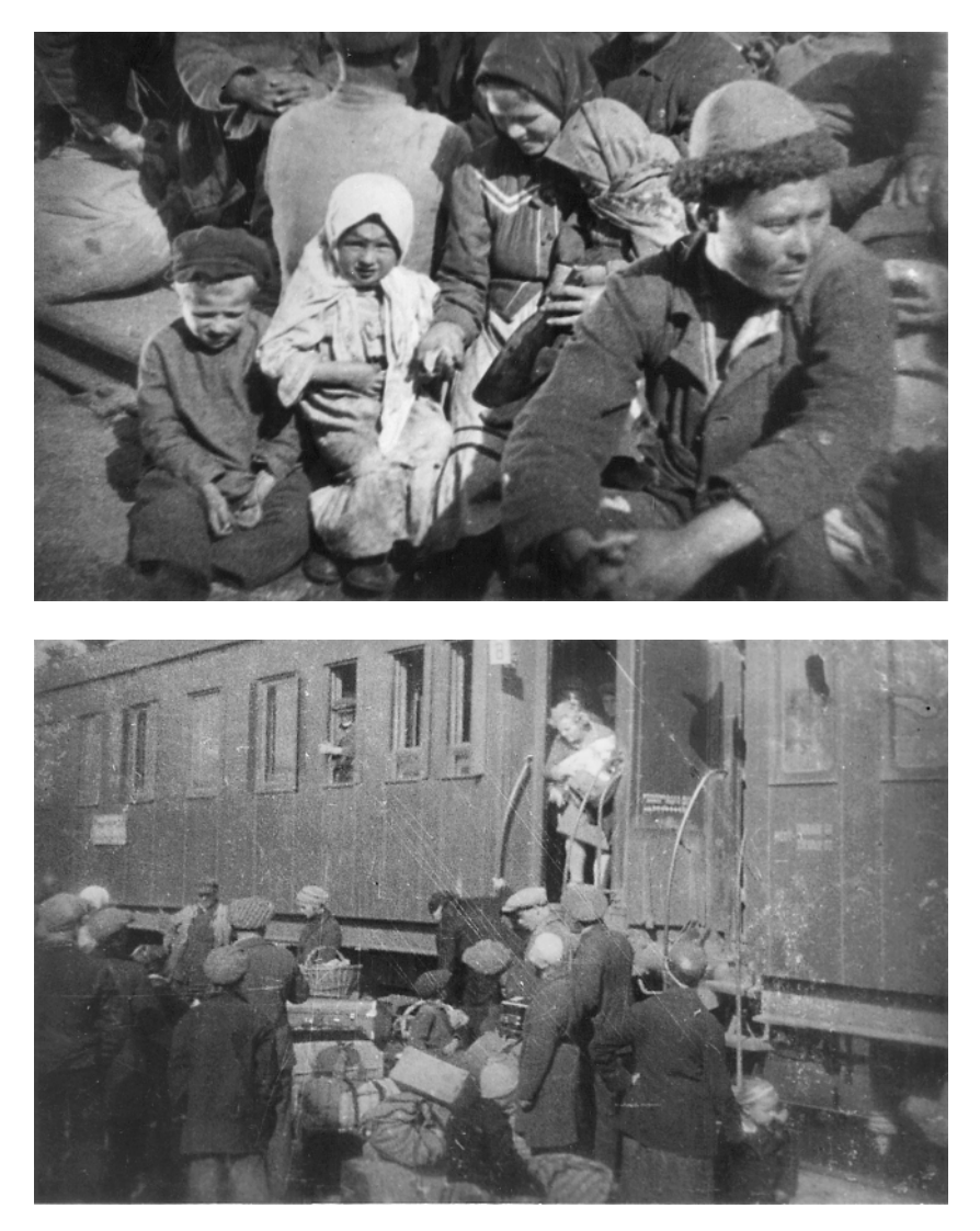
Workers and their families arriving at the railroad station in Magnitogorsk in search of jobs at the new metallurgical complex, then still under construction. 1931.