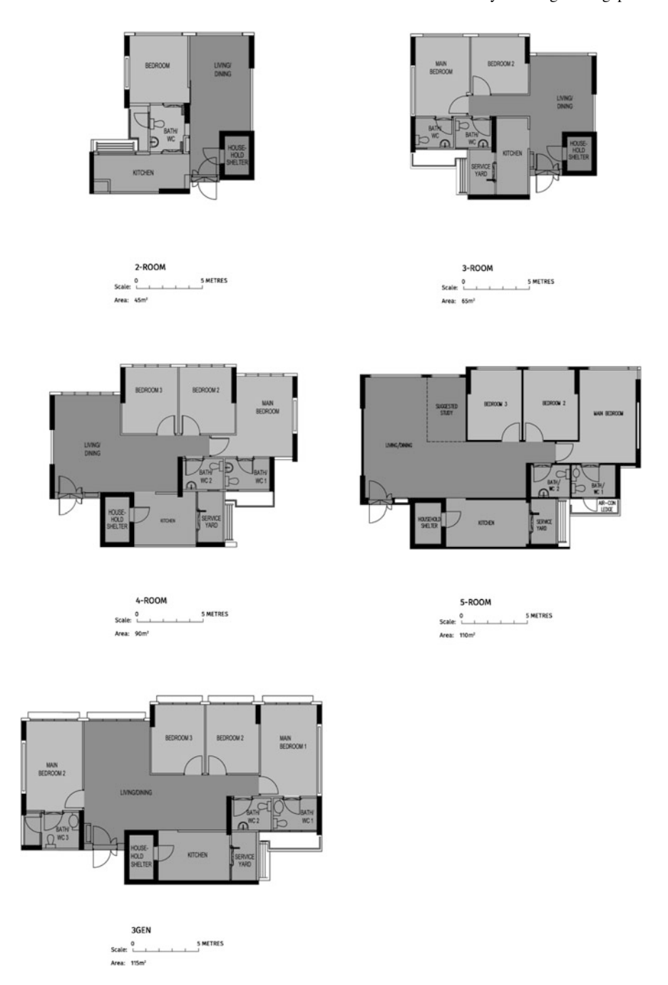
\textbf{Fig. 1.1} \ \ \, \text{HDB floor plans of various flat typologies. }