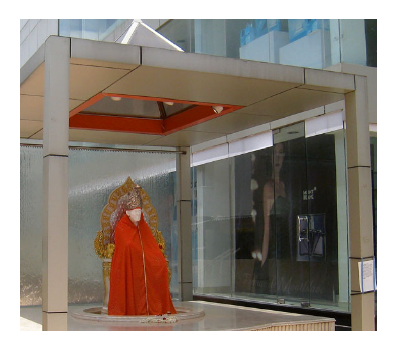
Fig. 7.2 Shirdi Sai Baba in a cubical quasi-shrine on 100 Feet Road, Indiranagar, Bangalore

as money laundering, advertising strategies, or investments by predatory capitalists who wish to cash in on the possibly dazzling future of this urban route and its real estate. Residents of Indiranagar—although they may be middle and upper class (from IT-BT backgrounds as well as in administrative, defense, police, and public sector employment)—will shop instead for their everyday needs in thriving markets on other nearby roads that resemble Lakshmipura or Ulsoor unless there are "festival" sales at the upscale stores during Christmas or Deepavali.