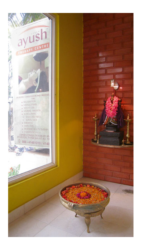
Fig. 7.3 Ayush Therapy Center, off 100 Feet Road, Indiranagar, Bangalore

as the "the ideal way of life for the twenty-first century". 12 This body also frequents food-stores and mini-supermarkets ("Fresh, Namdhari's organic foods, "Foodworld," "Food Point") and utilizes professional childcare services ("Kidzcare," "Neev"). These centers are novel innovations that traverse various practices of globality, Indian domesticity, and cultural futures and, along with Ayush, provide a network that underpins new spaces of interiority and exteriority. Indiranagar's Kidzcare, for example, cannot be located philosophically in the realm of Montessori or Indian early twentieth-century philosophies of education or in post-independence socialist crèches. Instead, it seems to be positioned simultaneously in the realms of the nation state (at least nominally as the children learn to sing the national anthem), English medium education, inculcation of moral citizenship (be polite and helpful, observe cleanliness), Indian television as a Zee franchise, and the new social context of a (largely) two-income family context where parents work for IT-BT companies (rather than the public sector) or in single but professional parenthood. In the spatial complementarity of Ayush with the cosmopolitan single family/single parent home (upstairs-downstairs), we come full circle from the roadside shrine abutting a not so affluent house dedicated to the (divine) infant that mediates the zone between home and public spaces (back-front).