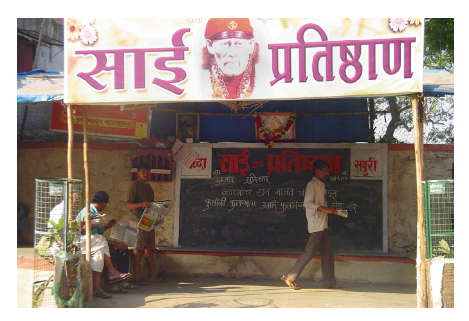
Fig. 9.2 Sai Temple as part of a mandal on the streets of Pune

located on a tenuous boundary between what is considered as public and what counts as private space by the users themselves.