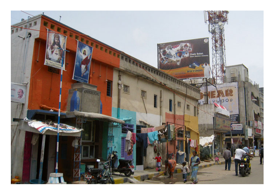
Fig. 7.1 Christian roadside shrine in Lakshmipura, Ulsoor area, Bangalore

The roadside shrine in Lakshmipura, a section of Ulsoor to 100 Feet Road, is situated in an arena of dense visual and spatial intersections (see Fig. 7.1). A slender cross extending from a mounted pole on the road marks the site from a distance as sacred. On the surface of buildings (painted in yellow, orange, white, and blue) that are juxtaposed to the shrine are two scrolls—one of Christ the King and the other depicting Jesus amidst the heavenly sky. Facing the shrine, an onlooker sees on its left a banner depicting M.K. Gandhi (1869–1948) and Dr. B.R. Ambedkar (1891–1956) as heroically iconic figures of a "Harijan Seva Sangha" (service association for Dalits) and a housing colony. On its right is a large advertisement for calling cards shouting "Dubai Chalo" (Let us go to Dubai). The pavement and road is busy with children, two-wheelers, housewives, and pedestrians negotiating the metro construction's debris; its unfinished T-like pillars stand along the road vying for dominance with the wireless communication tower overhead. Despite the disruption of metro work, this area continues to be an important market for everything from