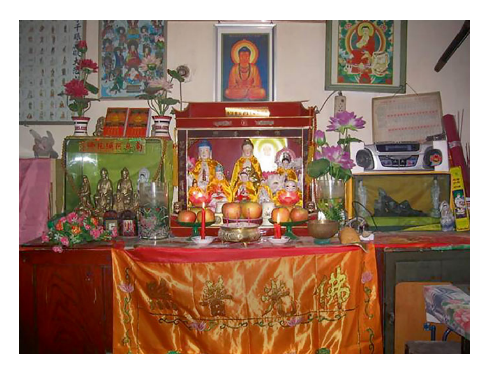
Fig. 6.2 An altar in the Beijing home of a contemporary Buddhist lay practitioner

similar to sectarian religious organizations of the late imperial period but very different from localized religious practices such as the worship of ancestors or placebased deities. It also differs from cults to deities such as Bixia Yuanjun, which, although not fixed at one particular temple, were connected to wider geographies of place.