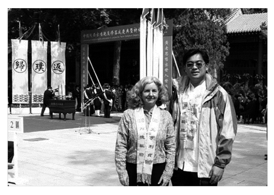
Fig. 5.1 The author and Wei-yi, a Singaporean Daoist priest and youth leader, at Louguantai, attending the opening ceremony for Laozi's preaching platform. April 2007

Central to the event in Hong Kong was an exhibition on editions and translations of the Daodejing that included rare early editions of the text. After seeing hundreds of foreign language translations on display, some conference participants speculated that there must be more translations of the Daodejing than the Bible. Although this is incorrect, no doubt many contemporary Daoists are aware that the Daodejing is a highly esteemed world classic. Whereas Daoist and popular temples in Southeast Asia and China used to give free copies of a traditional morality book, Taishang's Treatise on Action and Retribution to their visitors, many now give free copies of the Daodejing .<sup>22</sup>