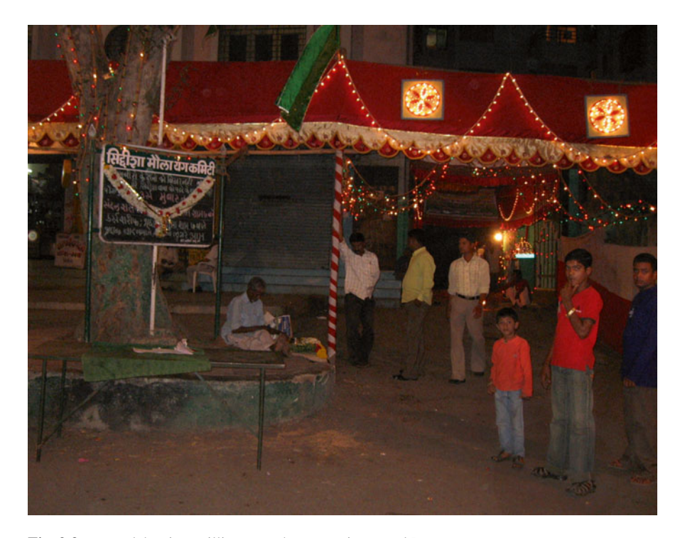
Fig. 9.3 Urs celebration spilling onto the streets in central Pune

(bhand\bar{a}r\bar{a}) every fortnight in the space adjoining their dargah in honor of the respective p\bar{i}r (holy guide-teacher) embraced by their primarily Muslim mandals. These instances point toward the ways in which residents of the locality engage with and construct the temporal and spatial rhythms of their area via the medium of mandals' activities.