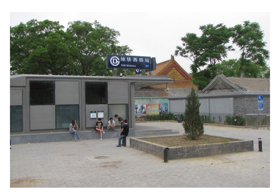
Fig. 6.1 The roof of the Mahavira Hall of the Temple of Universal Rescue as seen from an entrance to the new Xisi metro station

regulations exhibited by Beijing drivers (as I myself often discovered when trying to cross to the temple from the bus stop on the other side). Moreover, the surrounding neighborhood itself has undergone a dramatic and traumatic series of changes. As in many other areas of Beijing, clusters of hutong have been systematically razed. Ironically, the multistoried administrative offices of the Beijing Bureau of Land Management have replaced the homes that once stood directly to the south of the temple. Throughout the beginning period of my fieldwork in the early 2000s, the neighborhoods directly to the east of the temple (once part of the temple itself) were being razed to accommodate the widening of Xisi Bei Dajie highway and the construction of the Xisi metro station which was finally finished in 2008 (see Fig. 6.1).