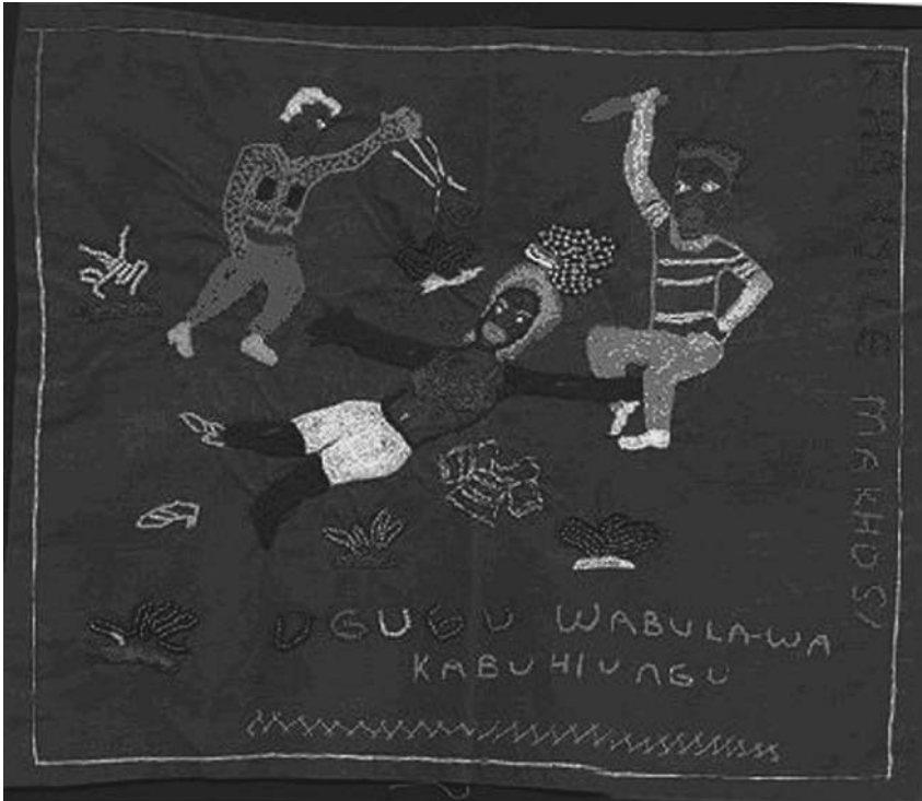
Figure 9.2 Makhosi Khanyil, no. 798.

meaning of so-called life. The day has come when all prison doors open and we are free from prison chains. Freedom! Freedom! How long we've been waiting for you.