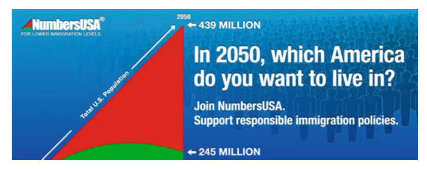
Fig. 4.2 Graphic © NumbersUSA, used with permission

area, which literally explodes off the chart, illustrates the impact of increased immigration levels as a result of the 1986 Immigration Reform and Control Act and subsequent Congressional immigration actions."<sup>57</sup> The AICF narrates a dangerous path, leading all the way to anarchy: