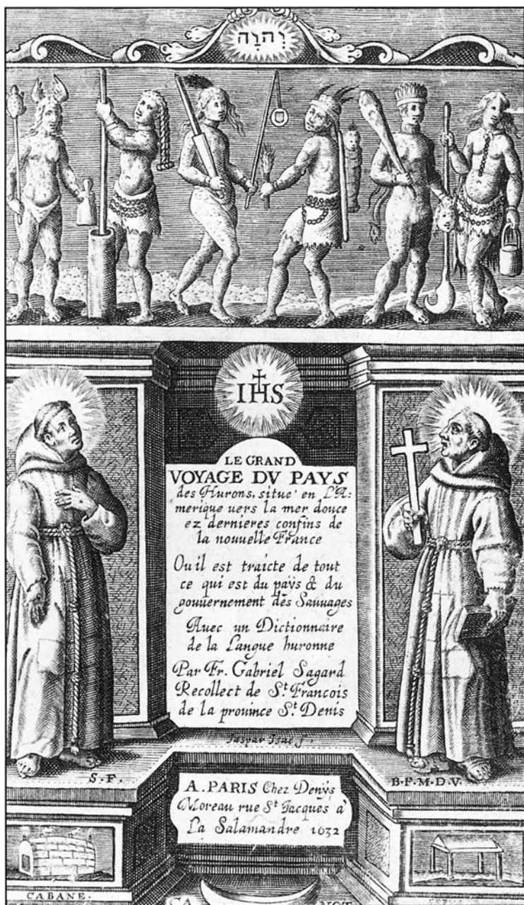
France's Catholics actively pursued the conversion of Indians in America, including the Hurons of Canada, whose modes of dress and housing were illustrated in this book supporting the missionary effort.