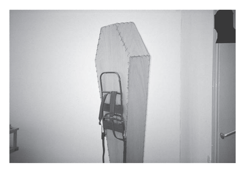
Plates 7, 8 and 9 Three exhibits from a 1996 Amsterdam exhibition mounted by Harry Heyink and Walter Carpey.

(7) Back-pack coffin: Symbolic portrayal of death's immediacy: we ever carry it with us. (8) Eco-friendly grave products and (9) Informal body packing expressing the affinity of ecological lifestyle and death-style.