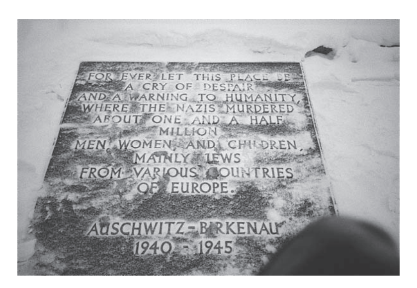
Plate 6 Auschwitz, a memorial A call to the world to assert memory in a camp that sought to obliterate Jewish identity.