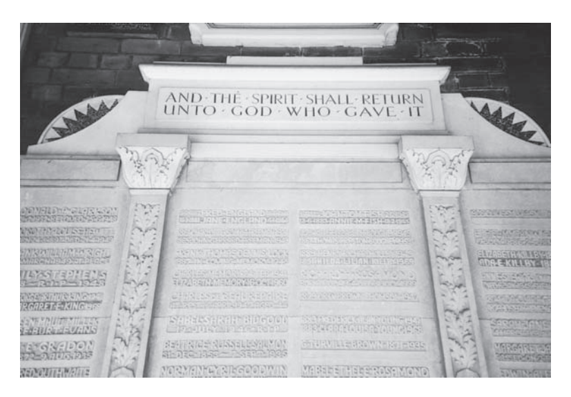
Plate 5 Golders Green Crematorium, marble memorial Memorial plaques significant given the likely absence of gravestones over ashes.