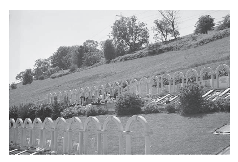
Plate 11 Communal Memorial, Aberfan Cemetery, South Wales Architecture expressing unity in loss and grief.