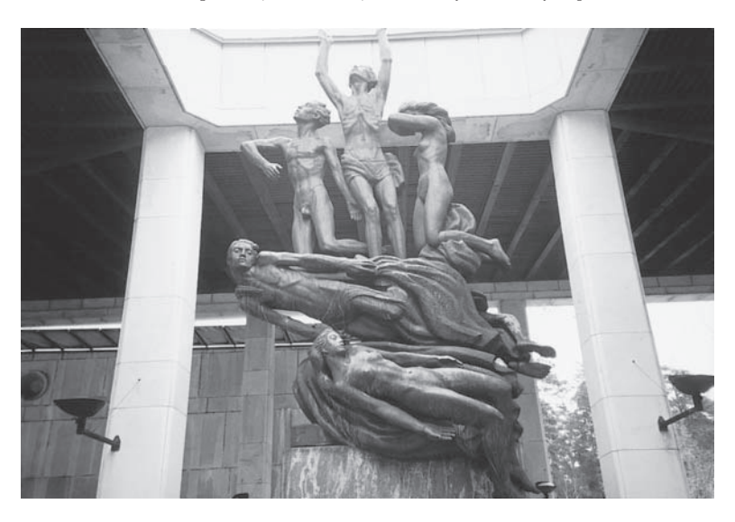
Plate 2 Stockholm crematorium exterior sculpture close-up Sculpture, The Resurrection , by Joel Lundquist, depicts the upward journey of the self in death's conquest. Art's role in human reflection on destiny.