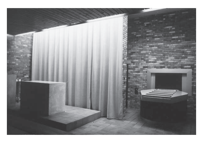
Plates 3 and 4 Bordeaux Crematorium interior with no symbols (above) and with crucifix and candles (below)

Together these depict the sacred–secular option modern crematoria offer to individuals by the use or absence of religious symbols.