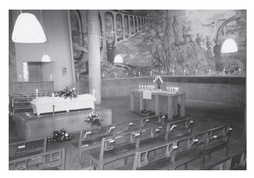
Plate 1 Stockholm crematorium interior Main Chapel of Stockholm's renowned Woodland Cemetery Crematorium by Architect Gunnar Asplund (1885–1940). Fresco Life-Death-Life by Sven Erixson.