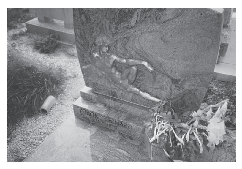
Plate 12 Gravestone: Hungary Artistic expression of individuality of a self amidst the communal tradition of burial.