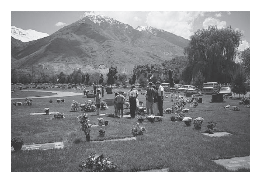
Plate 10 Memorial Day in rural Utah Annual Memorial Day in May with families tending graves in a strongly traditional and burial-focused society.