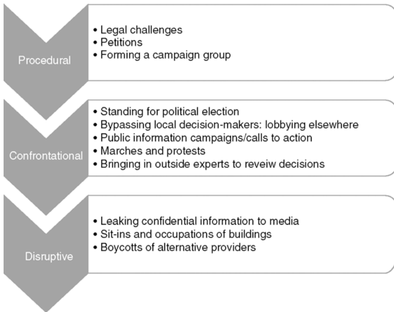
Figure 6.1 Three categories of tactics in hospital closure protests

the most frequently discussed confrontational tactics are marches and protests (Barnett and Barnett, 2003; Brown, 2003; Fulop et al., 2012; Haas et al., 2001; Kirouac-Fram, 2010; Oborn, 2008; Taghizadeh and Lindbom, 2014) and ‘going the political route’ (Fontana, 1988). Brown (2003) describes the symbolic power of a march of an estimated 12,000 people, led by a horse-drawn hearse, to protest the proposed closure of an English hospital. However, Barnett and Barnett’s (2003) New Zealand study, noted that both marches and protest meetings had little impact on actual decision-making, functioning instead, they argue, to relieve stress and direct anger at decision-makers. Whether effective in altering outcomes or not, I include protest marches within confrontational tactics because they are a show of strength that spills outside the prescribed venues of the formal consultation process. They come from the classic political ‘repertoires of contention’ (Della Porta, 2013) that Tilly (1986) traces back to the French Revolution.