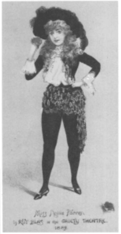
5 Nellie Farren in the burlesque Ruy Blas , Gaiety Theatre, 1889. Reproduced by kind permission of the British Library.