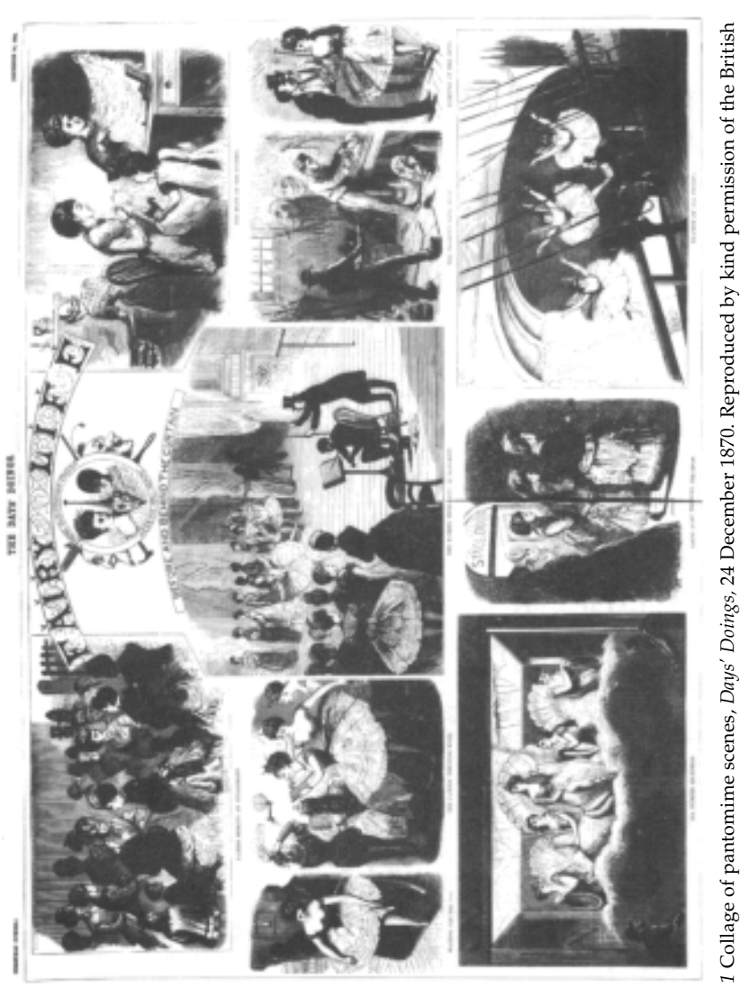
1 Collage of pantomime scenes, Days' Doings, 24 December 1870.