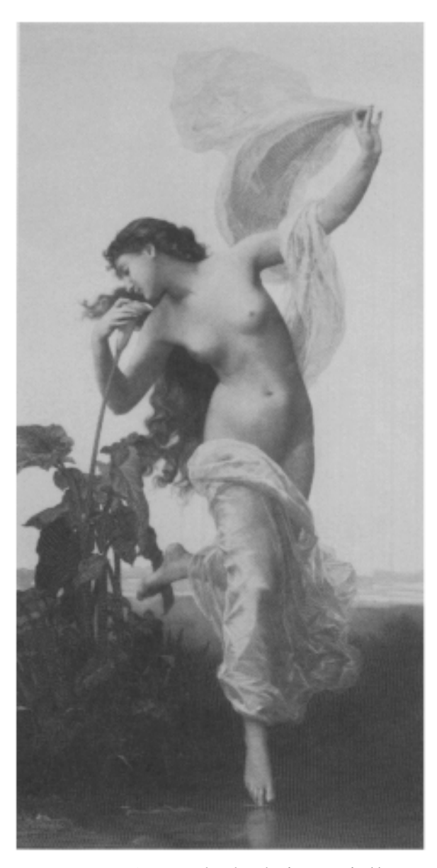
9 Bouguereau, Aurora , realized in the first set of tableaux vivants at the Palace Theatre, 1893.