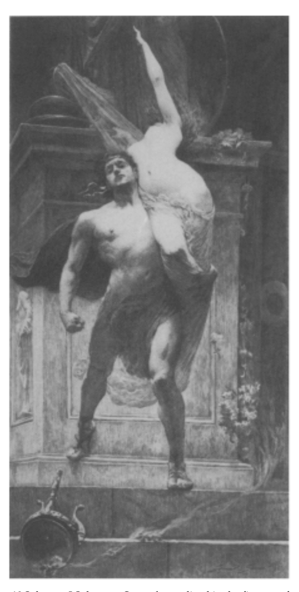
10 Solomon J.Solomon, Cassandra, realized in the first set of tableaux vivants at the Palace Theatre, 1893. Reproduced by kind permission of the British Museum, Department of Prints and Drawings.