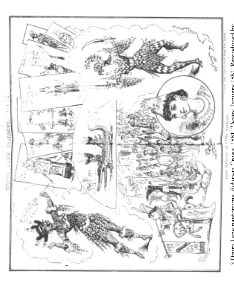
3 Drury Lane pantomime, Robinson Crusoe, 1881, Theatre, January 1882.