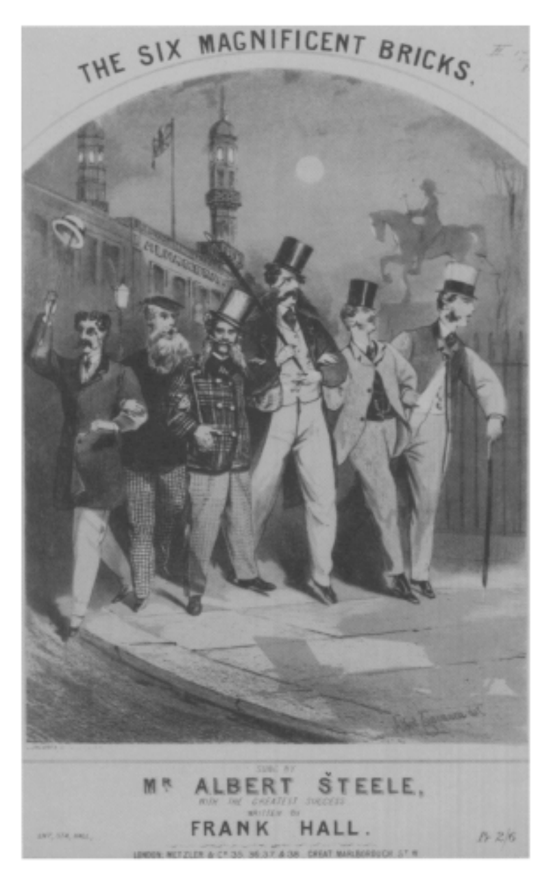
13 Song sheet cover for 'The Six Magnificent Bricks', 1866.