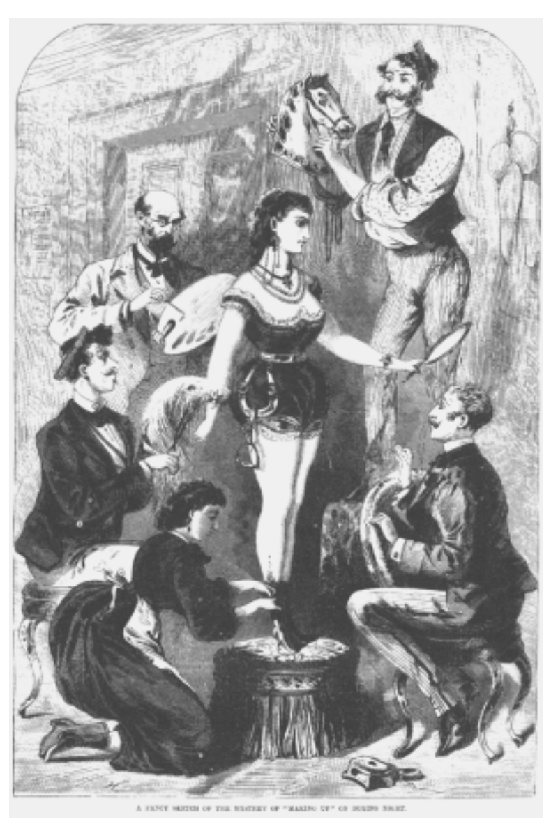
4 A pantomime chorister, her attendants, dressers, and admirer, Days' Doings, 24 December 1870.