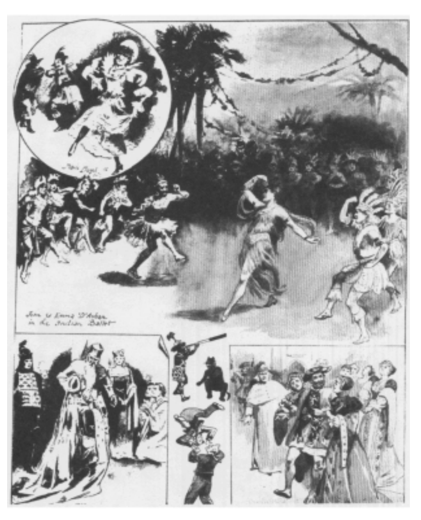
2 Drury Lane pantomime, Robinson Crusoe , 1881, Illustrated London News , January 1882.