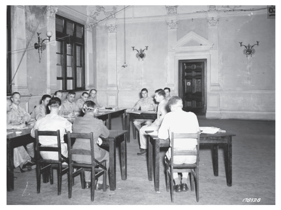
Few photos were taken of U.S. Army courts-martial. This one shows a World War II trial.