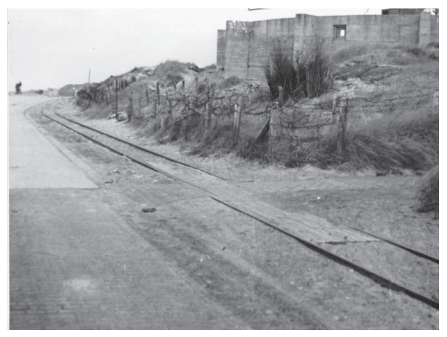
Site of the Ostland battery with the tracks of Borkum's railroad clearly visible.