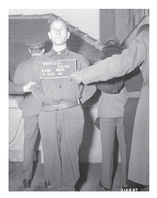
Erich Wentzel is about to be hanged at Landsberg prison.