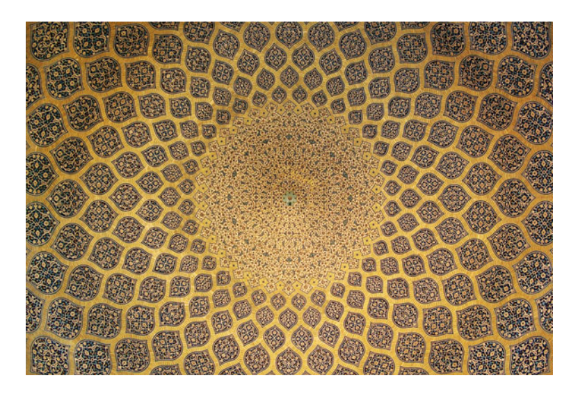
Fig. 5 Isfahan, Sheikh Loft Allah Mosque, interior of the Dome.

The interior mosaics in the dome of Dome of the Rock are refined in the great dome of the Sheikh Loft Allah Mosque (Fig. 5). In the Dome of the Rock, the design is additive: half of the visual diameter is composed of concentric interlaces finished by a band of inscription; in the outer area three rings of ogival lozenges radiate outward toward a band of inscriptions in a ring above the ring of openings at the base of the dome.