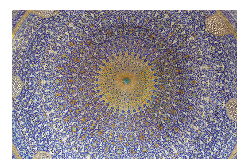
Fig. 7 Isfahan, Imam Mosque, interior of the Dome.

lessen in intensity as they approach reach a grounding on the drum from which the pattern will disperse, so the prose relaxes to the release "being flowed from it":