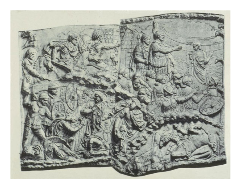
Fig. 2 Column of Trajan, Rome. Detail, section 29. Trajan sends Dacian Women Away from Battle. Cast, "Museo della Civiltà Romana"

overwhelming. It focuses our attention on the significance of the column and the surprise of the doorway in the base (covered with reliefs of heaping spoils of war). Originally, although not today, we would have climbed an interior spiral stairway to a viewing platform. According to McMaster's Trajan Project: