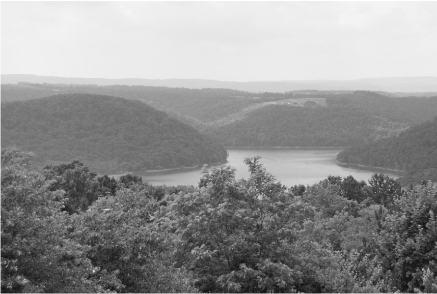
Figure 1.6. In many early settlement periods, the natural environment was seen as vast and something that needed to be tamed. This was the predominant perception during the settlement of North America.

view arose when the human population was small compared with the natural environment around it. In American society, this perception often led to a frontier mentality, which mistakenly assumes there will always be something more or better elsewhere after wastefulness has depleted the social, environmental, or economic resources of the current place. As the human population continues to grow beyond 7 billion, however, this perspective has proven to be flawed: Nature no longer has endless capacity to absorb those wastes as our built environments have become contiguous, dense concentrations of people and buildings instead of the loosely dispersed range of settlements common in preindustrial landscapes.