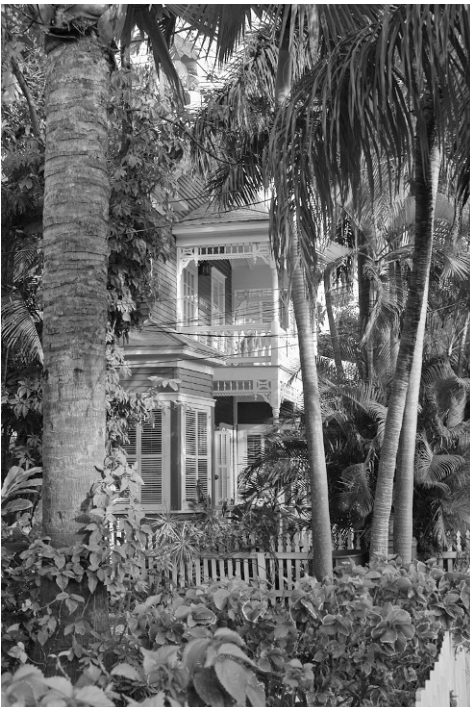
Figure 3.10. Porches, balconies, and landscaping can control sun and create shade.