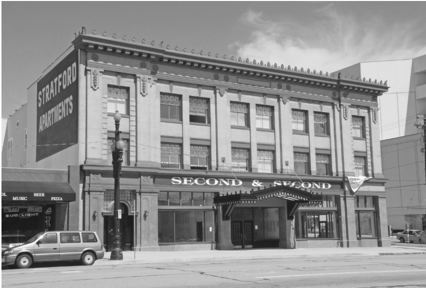
Figure 3.32. The Stratford Apartments building in Salt Lake City, Utah uses rooftop-mounted photovoltaic panels to help meet the electrical power needs of its tenants. The panels are located so that they cannot be seen from the street.

first century. Access to potable water and clean water for industrial processes is a growing problem as populations expand. For plumbing systems, a wide variety of products have been introduced to reduce flow in faucets and shower heads. Similar to lighting controls, infrared sensors in plumbing fixtures provide controls to turn water on or off and activate toilets and urinals. Numerous other plumbing products have been introduced, including low-flow or dual-flush toilets and waterless urinals. The Dana Building at the University of Michigan, built in 1903, uses a variety of alternative fixtures to reduce water consumption (McInnis and Tyler 2005). The use of localized water heaters and insulated pipes reduces the water volume (and the associated energy used to heat it) that would be wasted while waiting for water to warm up when turned on.