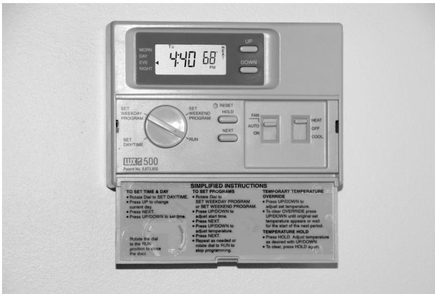
Figure 3.30. Programmable thermostats have been proven to be an effective means to reduce energy use and costs. Payback periods of less than 1 year are common.

In commercial applications where there are higher ceilings, a raised-floor air supply system is a good way to provide cooling and ventilation. This system is an innovative energy saver in which distributed air rises through the occupied space rather than being blown in from above. Therefore, discharge temperatures for cooling are warmer than overhead systems and use less energy to provide the same level of comfort. Raised-floor systems also provide a versatile way to route ducts, cables, and other service systems in a concealed manner but are not a solution for every project because the raised floor may