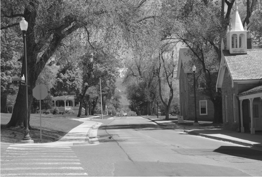
Figure 2.10. Collaborative planning, design, and construction management practices used at Fort Douglas in Salt Lake City, Utah enabled the conversion of this decommissioned army base into a “Living and Learning Community” that includes dorms, academic offices, and research centers for the University of Utah. This also was the site of the athletes’ village for the 2002 Winter Olympics.