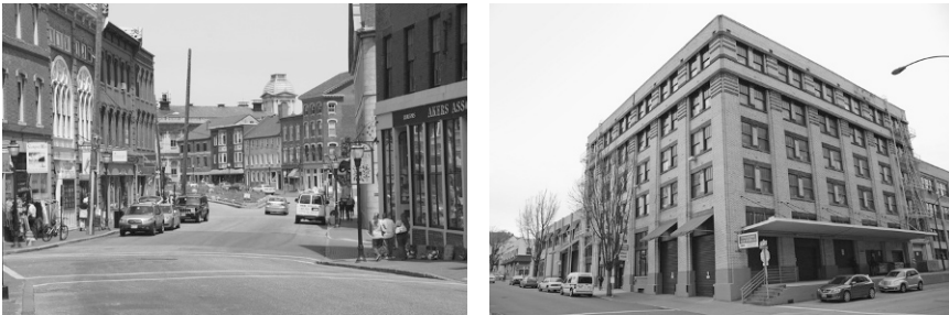
Figure 2.1. The Old Port in Portland, Maine (left) and the Pearl District in Portland, Oregon (right). Rehabilitation of warehouse districts has become a coast-to-coast phenomenon.

Without government protection, older neighborhoods are vulnerable to market forces, such as property owners building “monster homes” (fig. 2.2) after demolishing the original buildings. In this form of gentrification, the property owner is attracted to amenities of the local neighborhood (e.g., cultural