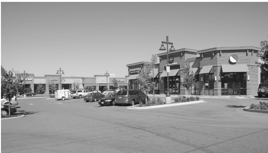
Figure 2.5. In this redeveloped urban retail site, a former grocery store (left background) was subdivided to incorporate smaller retail operations, and a new infill building (right foreground) was constructed in the parking lot to take advantage of the increased population density that has occurred in the Central City Historic District in Salt Lake City, Utah.