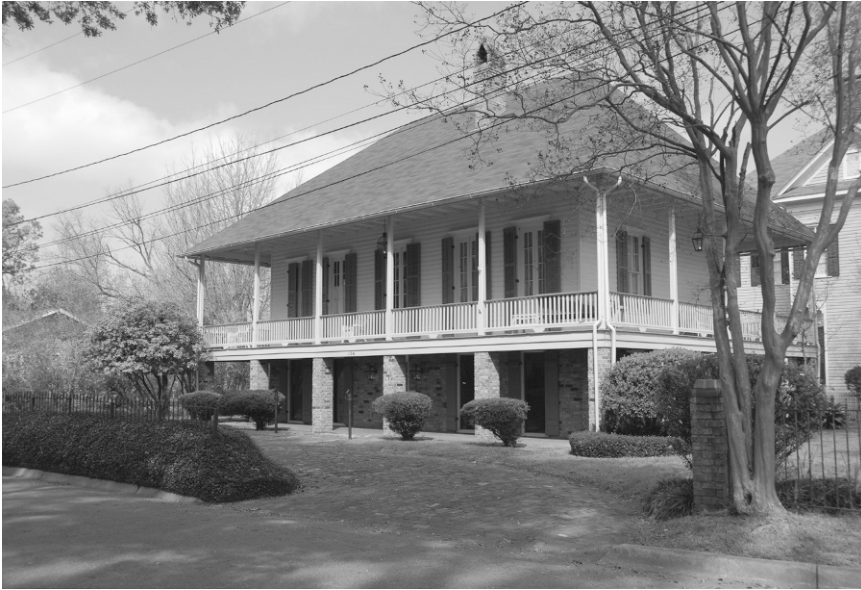
Figure 3.6. This house in Natchitoches, Louisiana incorporates numerous features that improve its passive thermal performance, including overhangs (used as porches) to protect from summer sun, louvered shutters for light and wind control, and light surface colors to reduce solar gain.