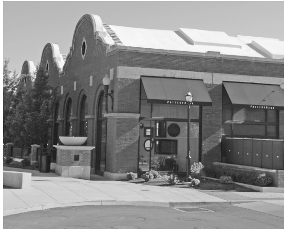
Figure 3.33. White roofing materials can immediately reduce summer heat gains. However, it is important to understand what visual impact they will have on the building when installed.

was black. The higher temperature also fosters a higher rate of ozone production, which when coupled with automobile emissions (and other air pollution sources) increases health risks throughout a metropolitan area. Other studies show that impervious surfaces force stormwater to run off into sewers and forestall the natural cooling effect that occurs as the water evaporates or percolates into the soil. With the causes in mind, the following factors can significantly affect the mitigation of heat islands: