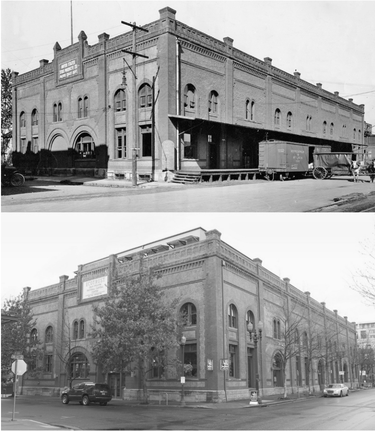
Figure 1.2. Before and after views of the Ecotrust Building in Portland, Oregon, which was the first historic restoration that earned a LEED-NC Gold rating.

As the rating systems and supporting methods have developed over the past decade, there has also been a growing realization that some buildings have not met the projected performance models used to determine their predicted level of sustainability. This indicates that there is still room for improving the overall approach to predicting future performance and assessing actual sustainability. These quantification systems have created another unintended consequence by initially focusing on only the building and the immediate site, to the exclusion of a broader planning-oriented view that includes sustainable transportation choices. Unlike large public works projects that require an environmental impact study (EIS), the site-at-hand approach has long been the norm for