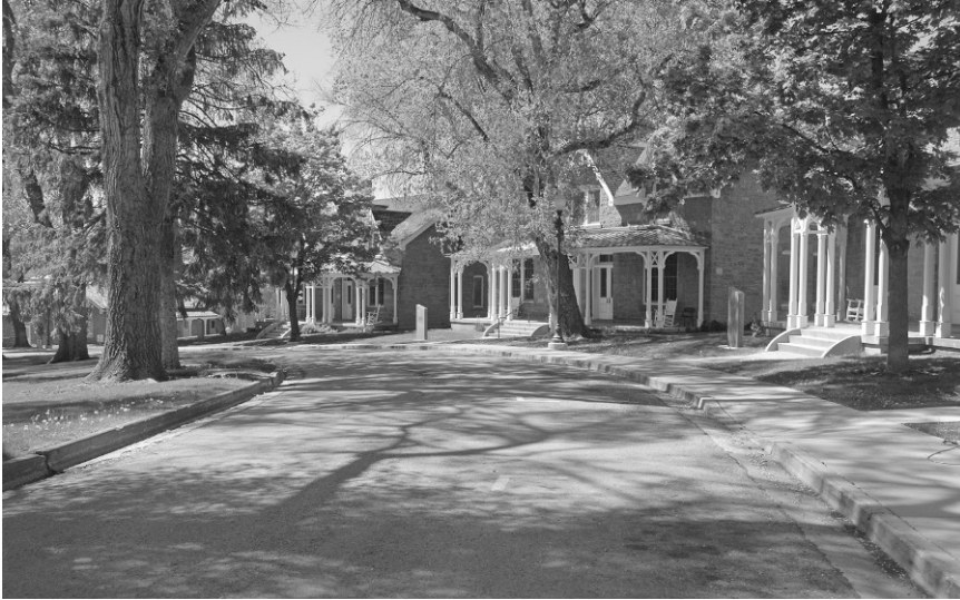
Figure 5.1. Fort Douglas, site of the 2002 Olympic Athletes' Village, in Salt Lake City, Utah, serves as home to the University of Utah's "Living and Learning Community."

need for accommodations for 2,500 athletes. The university removed nonhistoric buildings and used vacant space to construct dormitories and a hotel that provides housing for guests of the University of Utah, conference rooms, and meeting spaces.