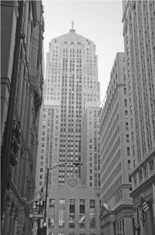
Figure 3.20. Early twentieth-century skyscrapers, such as the Chicago Board of Trade Building, constructed in 1930, used irregular floor plates to maximize opportunities for daylight and ventilation access.

office space is readily accomplished. Conversely, the spaces and historic character-defining features found in double-loaded corridors of alphabet buildings typically cannot be combined into a single space without jeopardizing tax credits because removing these walls destroys the historic integrity. Rather than create large open floor plans, building owners can create spaces that target smaller business operations that seek smaller spaces or can lease an entire floor.