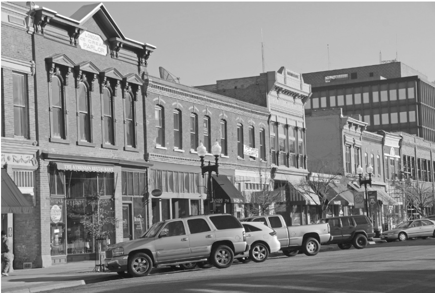
Figure 2.8. Height, width, and setback; massing; proportion of openings; horizontal rhythms; roof form; and material palette create the basis for the context analysis used to create design guidelines. Other aspects covered may address signage, pedestrian orientation, vehicle circulation, and parking. Shown here is part of the 25th Street Historic District in Ogden, Utah.

Recent guidelines pay more attention to how to accommodate sustainability. The key debate is that alterations that affect the visual coherence of a building should be given care in the decision processes. The secretary of the interior