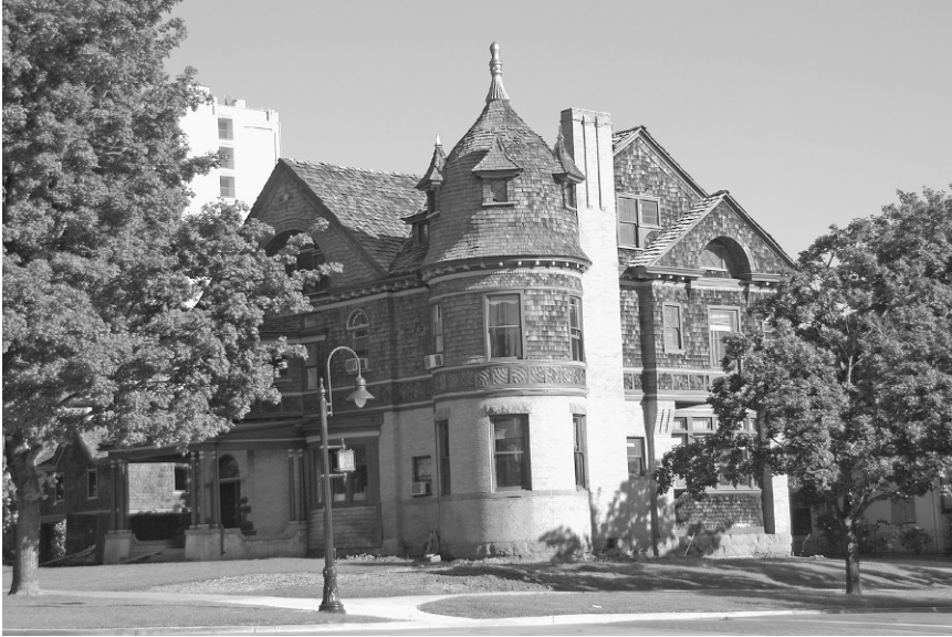
Figure 3.31. The Major Downey House in Salt Lake City, Utah uses an innovative heat exchange system. Although ground-coupled heat pumps are gaining widespread acceptance nationwide, the heat pump at the Major Downey House exchanges heat with the municipal sewer line adjoining the property.

conflict with existing windowsill and door heights. This approach is successful generally in industrial and warehouse reuse projects but has limited application in alphabet buildings because of the expense of installing ramps or adjusting doors and stairways.