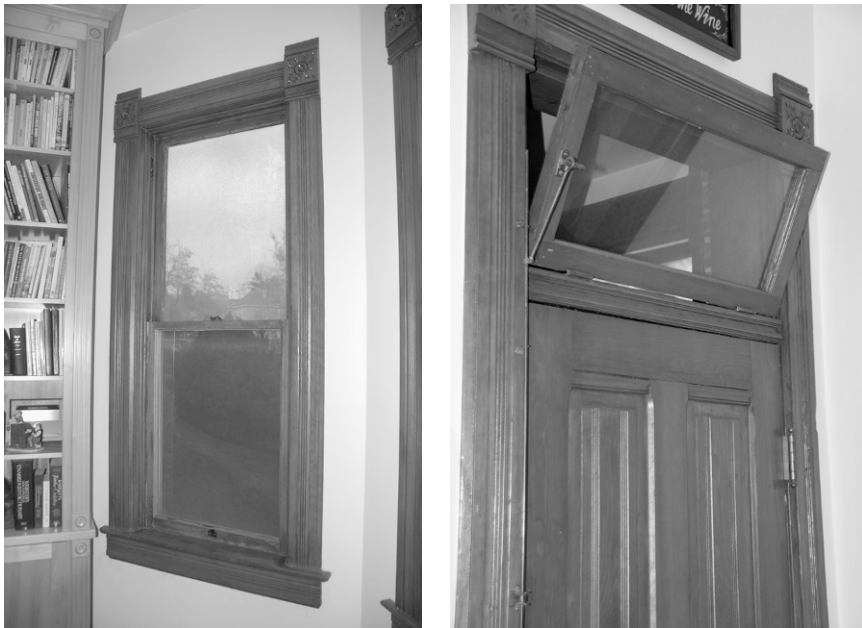
Figure 3.15. (a) Double-hung windows and (b) a transom provide opportunities for ventilation and nighttime cooling. The top sash is lowered at night, and the transom is opened to create an air flow path that relieves heat buildup at the ceiling.

Since the early twentieth century, there has been a shift away from thermal mass in the exterior building envelope (fig. 3.16). Masonry (adobe, brick, concrete, and stone) is more important as thermal mass than as an insulator. Many performance indices that rely simply on thermal resistance (R-value) of a material neglect the fact that masonry acts as a heat sink that absorbs heat and slows the exchange of heat for a longer period of time when compared with a less thermally massive material such as aluminum, and this can have important