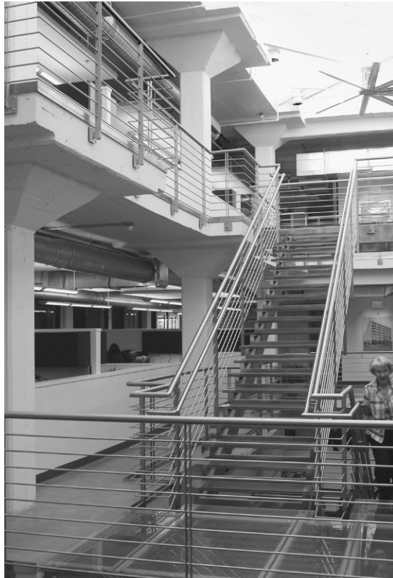
Figure 3.28. The Big D Construction Company conversion of (a) the Fuller Paint Company Building in Salt Lake City, Utah included creation of (b) a three-story atrium at the center of the building. The project earned LEED Gold certification and qualified for federal historic preservation tax credits.