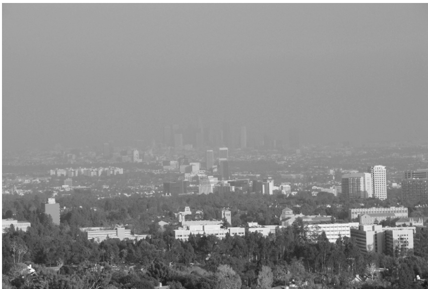
Figure 1.4. A view of smog-filled Los Angeles as seen from the LEED Silver-rated Getty Museum. Could green sprawl negate the sustainability improvements of new buildings by increasing the vehicle miles traveled to get to them? Can Americans recognize the sustainable benefits of reusing and preserving the built environment?