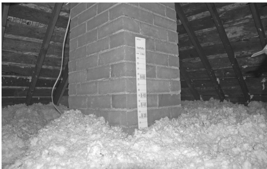
Figure 3.27. For residential buildings, insulating the attic floor is an effective way to reduce heat loss. This loose insulation, originally rated R38, has settled, as indicated on this installation gauge.