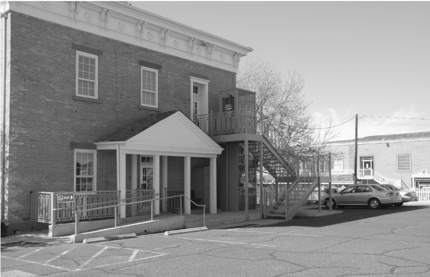
Figure 1.9. The Americans with Disabilities Act mandates accessibility upgrades to public buildings. One solution has been to redefine the main entrance as adjoining the parking lot (commonly at the rear of the building), where access for the disabled can be achieved more readily without compromising the historic features of the traditional front entrance. Shown here is the Washington County Courthouse in St. George, Utah.

means installing additional bracing and stiffening the walls and floors, which can have significant effects on the appearance and performance of the building as structural bracing is inserted into occupied spaces. Seismic activity is particularly problematic for unreinforced masonry buildings, where the joints between the stone, block, or brick offer little resistance to failure during an earthquake. The cost of the seismic upgrade is significant and may be prohibitive if funding is not available. This expense is eligible for historic tax credits that would then trigger a review to determine compliance with the Secretary of the Interior's Standards.