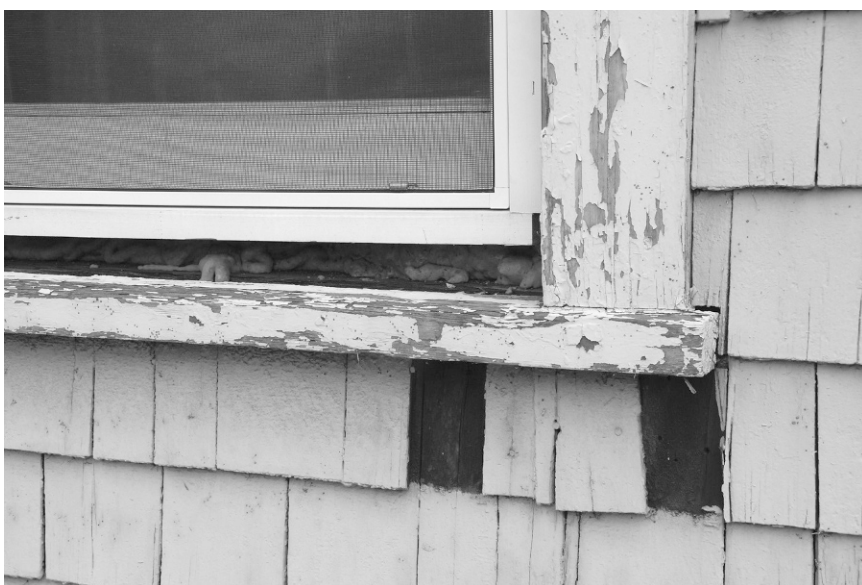
Figure 3.26. Foam insulation products will seep through any gaps that they can. There are insulation foam products with expansion rates specifically formulated for use in finished cavity walls.