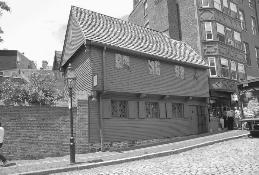
Figure 1.5. Restorations such as the Paul Revere House in Boston, Massachusetts are a direct example of the priorities of early preservationists, which led to a public perception that preservation was an avocation of the wealthy and was intended solely to make museums out of significant buildings.

Historic preservation thus suffers from the perceptual stigma of being anti-progressive, clinging unnecessarily to the past, and as being a hobby of the wealthy with no connection to the everyday man or woman. This lingering perception has formed a significant impediment to the broader acceptance of preservation (i.e., conservation) and reuse of existing buildings as is practiced in Europe, where the conservation of heritage and social identity is more strongly associated with reusing buildings and making them contribute to the vitality of the built environment.