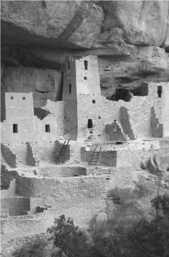
Figure 3.5. The cliff dwellings (reconstructed) at Mesa Verde National Park illustrate the aspects of vernacular architecture that stand the test of time. Incorporating such features as orientation for passive sun control, local materials, thermal mass, and natural ventilation, the buildings provided protection from the harsh climate of the American Southwest.

traditions developed in response to local climate demands, this awareness provided insights into building orientation, size, massing, ceiling height, and proximity to other buildings. As the profession of architecture emerged, architectural training included these aspects as inherent good design practice. Roman architect Vitruvius described the aspects of good design as firmness, commodity (usefulness), and delight. Through the millennia, buildings have been designed and constructed using these principles. By the industrial revolution, these low-technology principles were enhanced by the introduction of fundamental mechanical heating and cooling systems.