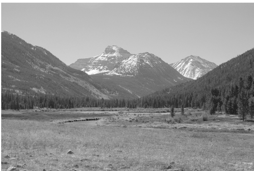
Figure 1.1. Stewardship of the built environment considers contemporary and future needs of society and balances those needs with their impact on the natural environment. The philosophy recognizes that a critical part of that balance is reuse of the existing built environment to reduce growth pressures and their impact on the natural environment.