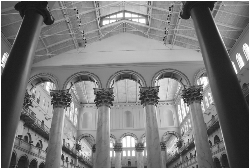
Figure 3.14. The Pension Building, completed in 1887 in Washington, DC, shows how the stack effect and cross-ventilation were integrated into commercial buildings.

Within a single space, transoms in combination with double-hung windows took advantage of the stack effect and cross-ventilation (fig. 3.15). With