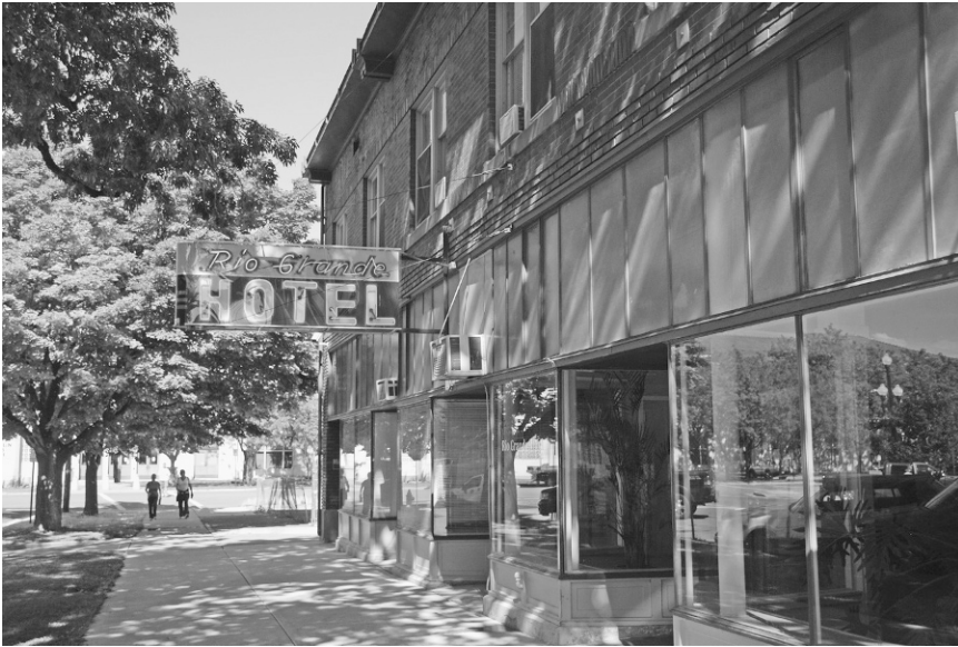
Figure 4.2. The Rio Grande Hotel in Salt Lake City, Utah was rehabilitated into a single-room occupancy building using a combination of Historic Tax Credits and Low-Income Housing Tax Credits.

mandates that priority be given to projects serving the lowest-income families and those that will remain affordable for the longest period of time. Federal law also requires that 10 percent of the tax credit allocation be reserved for nonprofit-owned projects.