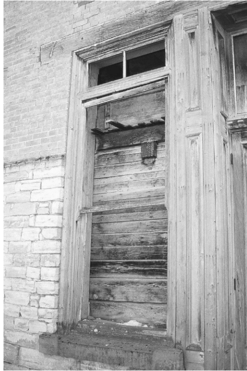
Figure 3.25. Wood windows can often be repaired for less money than complete replacement. This helps preserve authenticity and reduces environmental concerns about the fabrication of new materials and disposal of existing ones. Shown here are (a) the before and (b) after views of a window repaired at the Moroni Opera House in Moroni, Utah by the Traditional Building Skills Institute.