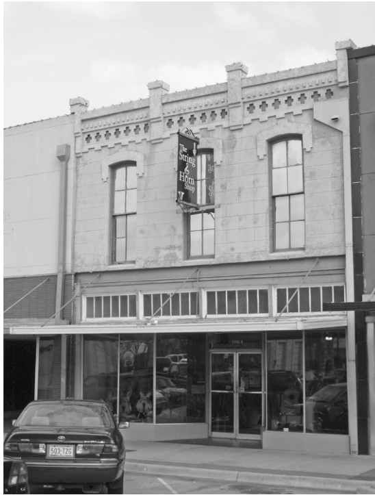
Figure 3.1. The landfill impact of the demolition of one typical 25- × 120-foot commercial building (example shown on the left is from Bryan, Texas) is equivalent in volume to 1,334,000 aluminum cans. This comparison does not take into account the embodied energy lost in the demolition.