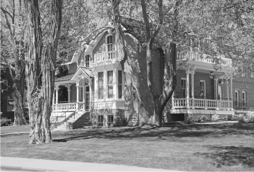
Figure 5.2. The former post commanding officer's house is now home to the Pierre Lassonde Entrepreneur Center. This rehabilitation won a preservation award from the Utah Heritage Foundation in 2009.

present, and future into a sustainable community. The model that this project provides can be repeated innumerable times as communities seek ways to redevelop underused or vacant former industrial buildings at a broader scale than a single building.