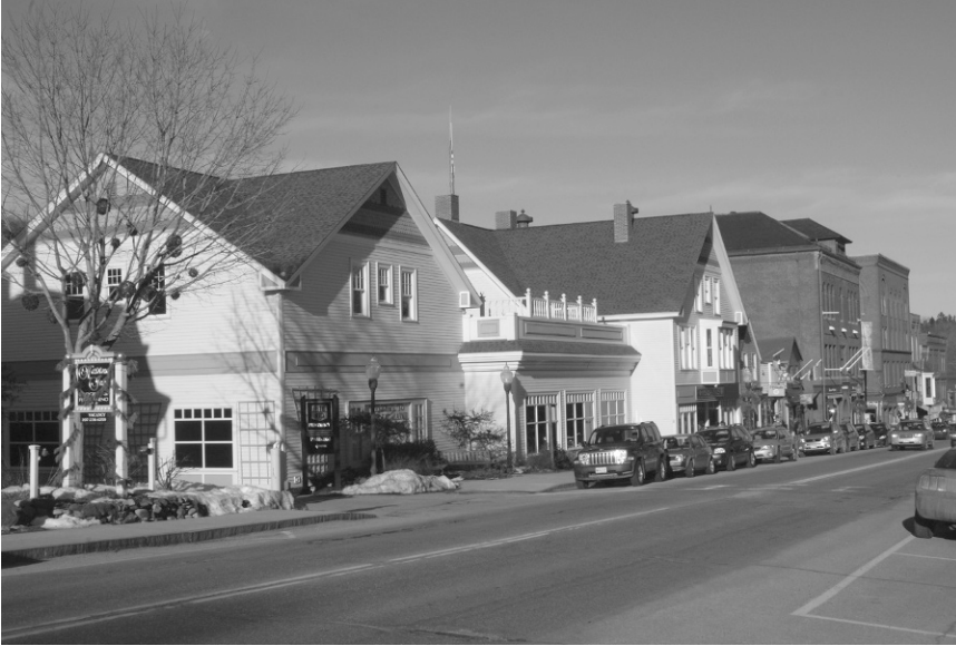
Figure 2.9. Well-formulated preservation ordinances, design guidelines, and demolition ordinances can prevent the loss of historic resources and prevent incompatible infill. This Rite-Aid Drugstore in Camden, Maine demonstrates compatible infill.

has recognized the implications that demands for implementing sustainability measures will have on historic buildings and released The Secretary of the Interior's Standards for Rehabilitation & Illustrated Guidelines on Sustainability for Rehabilitating Historic Buildings in 2011 to address the following issues: