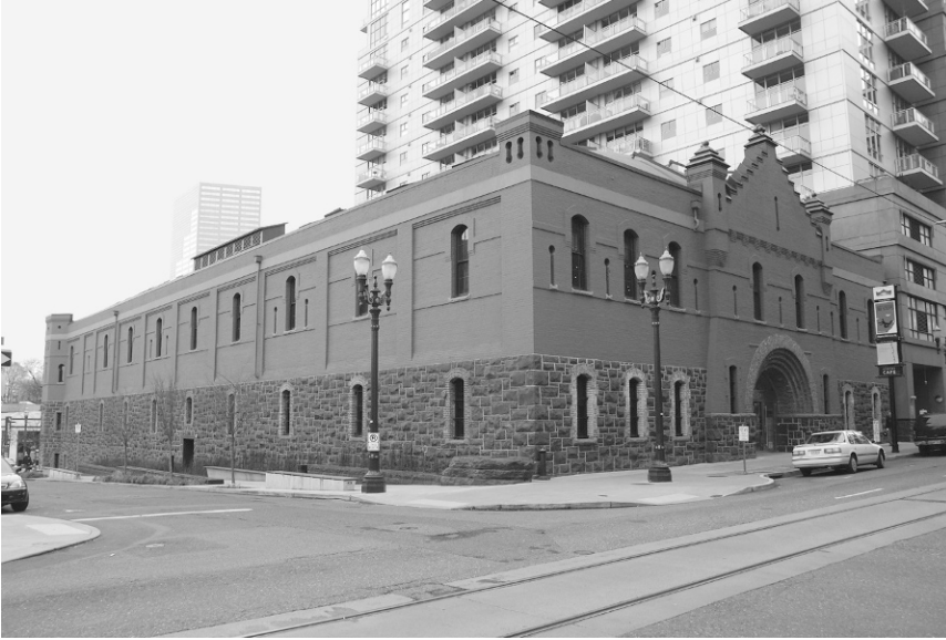
Figure 4.1. The Gerding Theater in Portland, Oregon was the first building to attain both LEED Platinum certification and historic preservation tax credits in the United States.

ments may conflict with the Standards . Likewise, some tax credit programs such as the Renewable Energy Tax Credit (Section 48 of the Internal Revenue Code) cannot be used with the HTC (Hykan 2009). Federal, state, and local program coordinators administering these programs will be able to indicate at the start of a proposed project where the potential problem areas lie and whether the tax credits can be combined. Two of the more common programs used with the preservation tax credits are the Low-Income Housing Tax Credit (LIHTC) (fig. 4.2) and the New Market Tax Credit (NMTC). Unfortunately, the LIHTC and NMTC cannot be combined, and the LIHTC cannot be used with the 10 percent HTC.