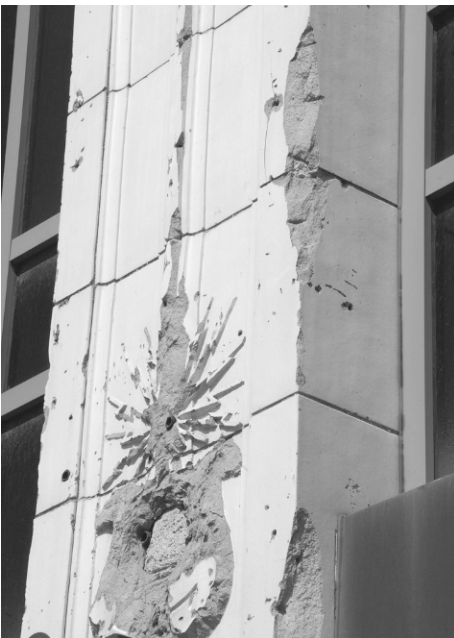
Figure 3.19. Installation methods for curtain walls can damage or remove the character-defining features of the original construction and compromise the historic integrity of the buildings. Shown here is damage caused by a curtain wall installation that has since been removed.