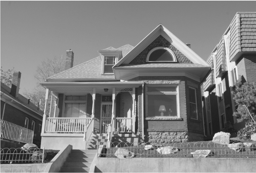
Figure 3.4. G. H. Schettler House, Salt Lake City, Utah.

the construction and demolition wastes could have on the landfill (box 3.2). Using Case 1 as a baseline, the analysis revealed that both of the other two cases generated significantly more material flows, respectively 4 times and 7.4 times as much as Case 1. In this framework, the analysis clearly demonstrated that Case 1, the retention and rehabilitation of the existing house, had the lowest overall aggregate of material flowing to and from the house.