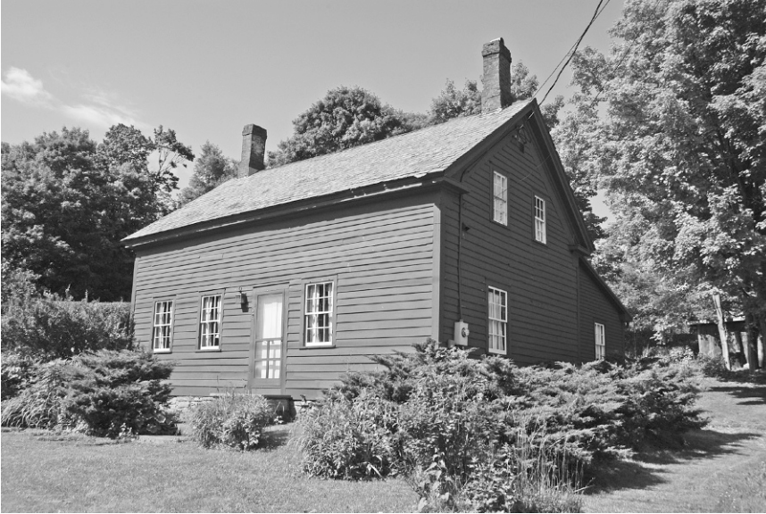
Figure 3.7. Buildings in cold climates are more compact, have fewer windows, and are oriented for solar access. Shown here is a small house in Essex, New York.

windows, this created a sheltered area at the front of the building (fig. 3.9). Sun along the western side is more difficult to control, and buildings with their long façade facing west have greater overheating problems in summer months if there is no planned shading to help control exposure to sunlight.