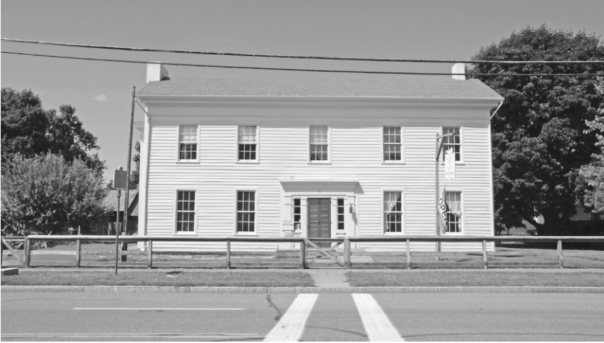
Figure 3.9. Orientation plays an important role in sun exposure. Typically buildings with their longer orientation running east to west have better passive solar performance than buildings with the longer orientation running north to south because the admission of direct sunlight can be more readily controlled with horizontal shading elements.