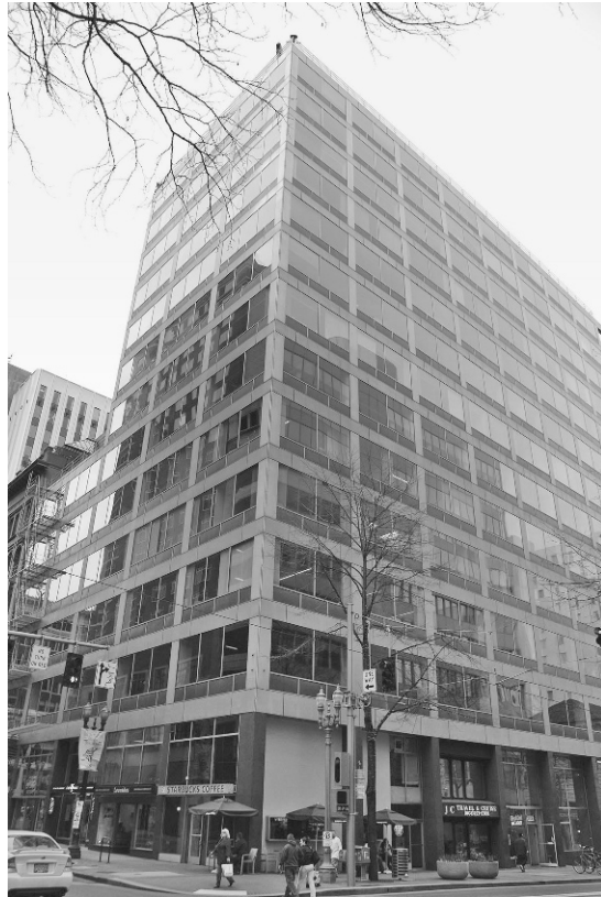
Figure 3.17. The shift away from thermal mass occurred throughout the twentieth century. The Commonwealth Building (originally the Equitable Building) in Portland, Oregon (1948) was the first fully curtain wall enclosed building.

enable HVAC systems to control thermal comfort. As air conditioning became more widespread, the acceptable range for thermal comfort narrowed. In the process, the use of operable windows in commercial buildings largely disappeared. As office buildings were built in the mid-twentieth century, HVAC comfort control began to dominate. Subsequently, architecture of the period became disconnected from local climatic forces, and many of the inherent design principles well known in the early twentieth century eventually fell out of use (fig. 3.18).