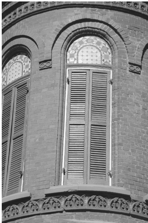
Figure 3.11. Shutters provide control for sunlight and ventilation. Shown here are shutters on a house in Galveston, Texas. Windows in warmer climates are typically larger to provide greater opportunity for summer ventilation.

Arcades along the perimeter of a building or flanking an interior courtyard provided relief from direct sunlight. Openings such as doors and arches along the perimeter permitted cross-ventilation. In drier climates, fountains and pools provided evaporative cooling. In more humid environments, a fountain