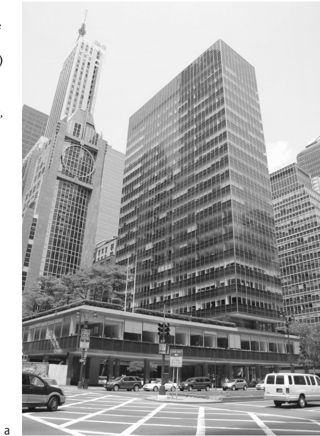
Figure 3.23. (a) The Lever House upgrade replaced the curtain wall system with a (b) visually comparable but higher-efficiency assembly. Conversely, in the residential sector, the approach of the deep energy retrofit includes increasing the envelope thickness by several inches for additional insulation. Both approaches raise questions about retaining historic integrity and would nullify any preservation-based funding eligibility.