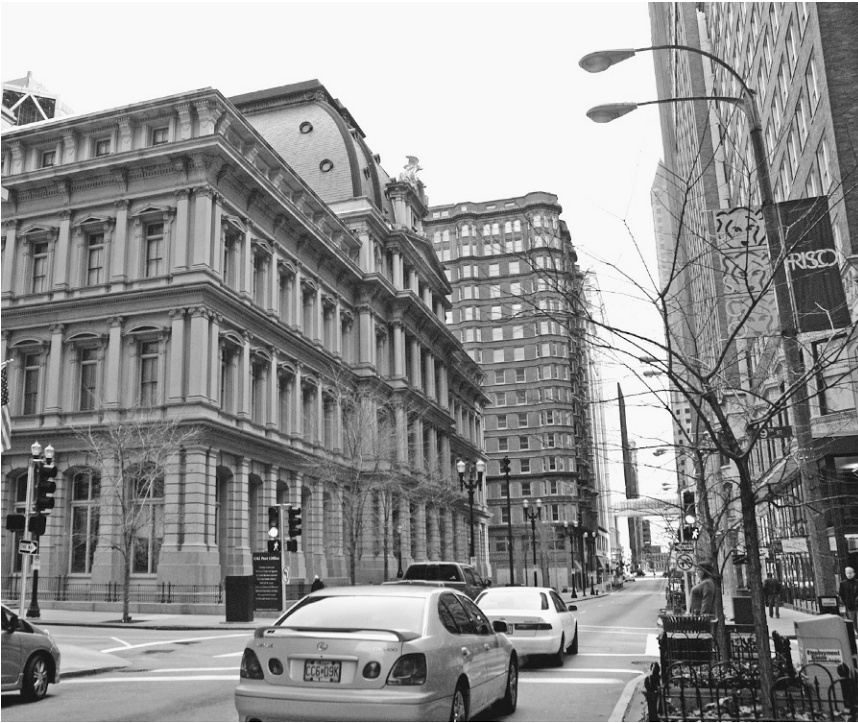
Figure 5.5. The Old Post Office Building in Saint Louis, Missouri.

more than 2,200 structures. The primary architect was Alfred B. Mullett, who designed many significant state and federal buildings in the late 1800s. The building is important for three reasons: It is an excellent example of the Second Empire style, its original construction details well represent cutting-edge late nineteenth-century technologies; and it represents the vanishing type of federal architecture in a substantial state of preservation and reuse (GlassSteel andStone.com 2011; NTCIC 2011).