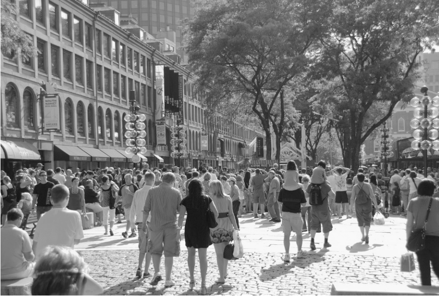
Figure 1.11. Preservation has evolved and matured by moving from iconic house museums such as the Paul Revere House (shown in fig. 1.5) to revitalizing cities both large and small with projects such as Faneuil Hall Marketplace in Boston, Massachusetts.

Respect historic integrity: An increasing number of sensitive and successful rehab projects demonstrate that historic buildings can go green without losing the distinctive character that makes them significant and appealing. Architects, developers and property owners no longer have to choose between getting the energy-efficiency they want or keeping the character they love; they can have both. (Moe 2008)