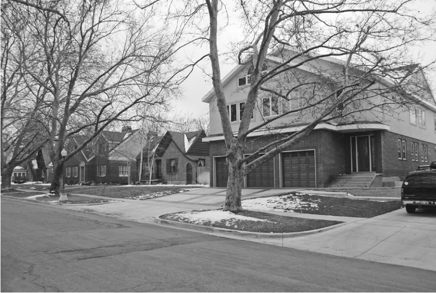
Figure 2.2. “Monster homes” typically are built in neighborhoods without design review oversight and often without regard to neighbors’ privacy and access to views and sunlight. Although they meet zoning ordinances and building codes, their scale and massing do not fit in with the adjoining buildings.

events, social and aesthetic diversity, proximity to work, alternative transportation options, social institutions, and medical facilities) but deems the housing stock too small. In 1950, the average house size was 983 square feet. By 2004, this average had grown to 2,349 square feet (Solomon 2009). Reports of single-family homes reaching several thousand square feet were becoming increasingly common until the real estate market declines of the past several years. This consumerist desire to have several thousand square feet of living space often conflicts with the typical size of a house built 50 or more years ago. Older neighborhoods are therefore at risk for demolitions and a variety of alterations that lead to the creation of monster homes, also known as blowouts, popups, McMansions, starter castles, and garage mahals.