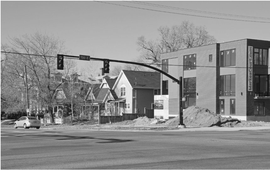
Figure 2.4. These buildings are the outcomes of two cycles of repopulation efforts in the Central City Historic District in Salt Lake City, Utah. The single-family house (center) was an infill project. The new townhouse project (at right) was used to infill a long-vacant lot and included demolishing three other buildings on adjoining lots.