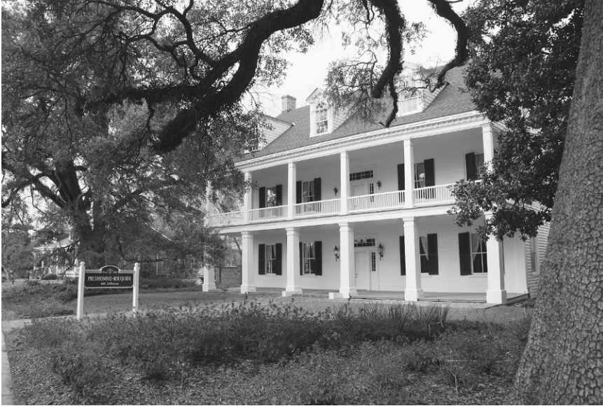
Figure 4.4. The Save America's Treasures program awarded a $250,000 grant to help restore and convert the 1806 Prudhomme-Rouquier House in Natchitoches, Louisiana to a meeting and conference center (Dono 2010).

buildings, structures, and objects. Grants were awarded through a competitive process and required a dollar-for-dollar match. The minimum grant request for collection projects was $25,000 federal share; the minimum grant request for historic property projects was $125,000 federal share. The maximum grant request for all projects was $700,000 federal share. In 2008, the average federal grant award to historic properties was $279,000 (NPS 2011c). The program was open to a broad spectrum of applicants, including the following: