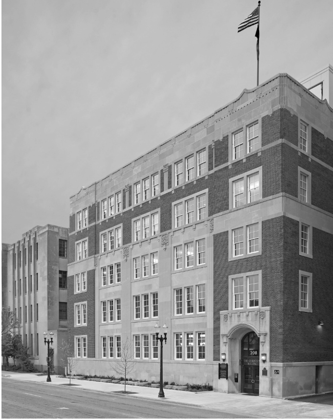
Figure 5.3. The Christman Building in Lansing, Michigan.

decided to relocate its headquarters to the heart of Lansing, Michigan's urban core. In 2006, the firm purchased the 1928 Mutual Building, which had formerly housed the headquarters of Michigan Millers Mutual Fire Insurance Company (Christman Company 2011; Gardi 2011).