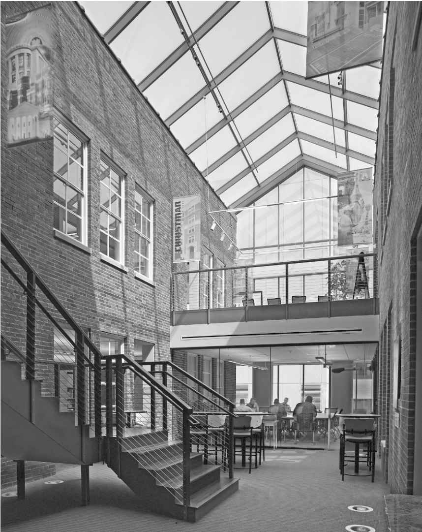
Figure 5.4. The atrium at the Christman Building.

Because this was a tax credit project, there was a diligent effort during the design phase to meet the Secretary of the Interior's Standards . The State