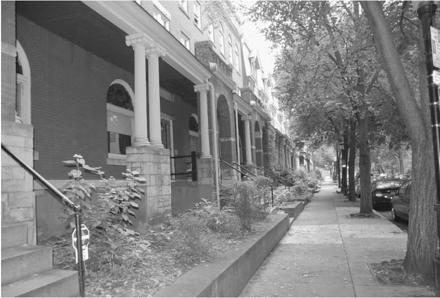
Figure 4.5. The Allegheny West Historic District is in Pittsburgh, Pennsylvania. The buildings date from the nineteenth century, and there are numerous locally owned businesses (e.g., shops, services, restaurants). The district is immediately adjacent to several cultural, sports, and recreational venues located in the Pittsburgh central business district.

output, $76.3 billion in income, $103.8 billion in gross domestic product, and $30.5 billion in tax revenues (Listokin and Lahr 2011: 3–11). As noted earlier, the Recovery Act created only four jobs per million dollars spent, a cost of $250,000 per job created (Rypkema 2010). Each job created was the equivalent of a full-time job for 1 year in which salaries are competitive within the local market for that particular type of job. Overall these figures reflect how expensive it is to create a job using the various strategies being described. Thus, $13,780/job and $8,660/job, respectively, for the Save America's Treasures program and the Historic Tax Credit program are vastly less than the $250,000/job that the stimulus program cost. When coupled with the multiplier effect created as the salaries are spent locally, these new jobs significantly increase the social and economic vitality of the community where the jobs are located. These data reveal that job creation through preservation-oriented programs is cost effective when compared with more highly publicized economic development programs.