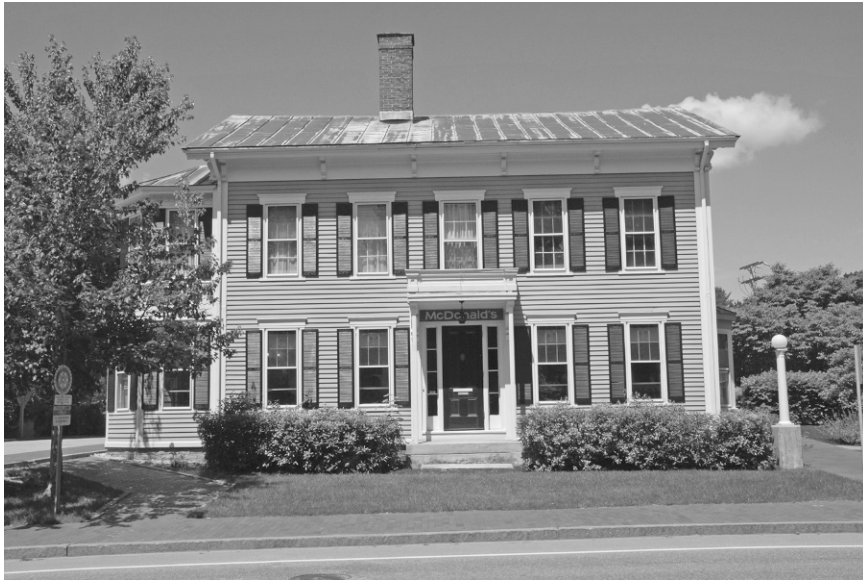
Figure 1.3. This McDonald's restaurant in Freeport, Maine, which adaptively uses a Federal-era farmhouse, demonstrates that community leaders can retain a sense of place in their community and require that buildings be reused rather than be replaced.