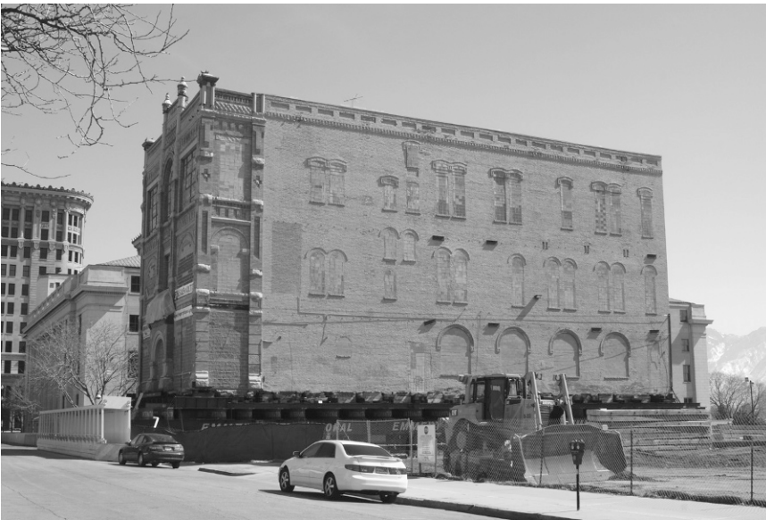
Figure 3.2. The Odd Fellows Hall in Salt Lake City, Utah was saved from demolition by moving it across the street.

In San Diego, redevelopment plans in the area of PETCO Park targeted the demolition of a three-story, 30,000-square-foot, unreinforced masonry building: the Showley Brothers Candy Company Building, built in 1924. However, instead of demolition, the building was moved across the street and out of harm's way. One analyst later estimated that preserving the building's 3 million pounds of brick saved the embodied energy equivalent of powering 145 homes for a year. The owners are investigating using the property for a