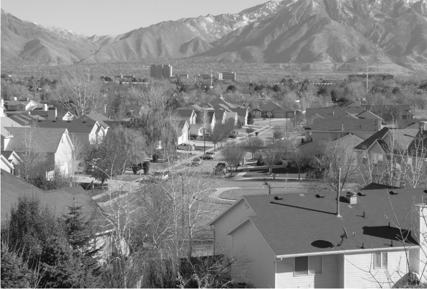
Figure 1.8. The Euclidean zoning system used in the United States has fostered sprawl in areas surrounding major urban centers and has led to an increased reliance on automobiles for transportation and the reduction of local agricultural production.

to the European attitude about rural land conservation. As Timothy Beatley, professor of sustainable communities at the University of Virginia, describes in Green Urbanism , “European rural and agricultural land uses are not seen as transient activities but as important societal uses,” and he further states, “Rural land, especially agricultural land, is preciously guarded” (Beatley 2000: 58). In the United States, as population centers grow, undeveloped land in the urban core becomes scarce. When coupled with easy access to interstate freeways, the need to expand and accommodate a growing population fosters sprawl and growth pressures on open lands within and beyond the suburbs.