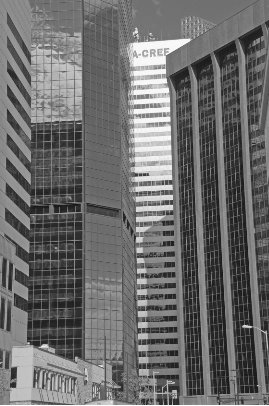
Figure 3.18. As curtain wall technology evolved, the use of operable windows gave way to HVAC control. The only fresh air came in through the mechanical system.