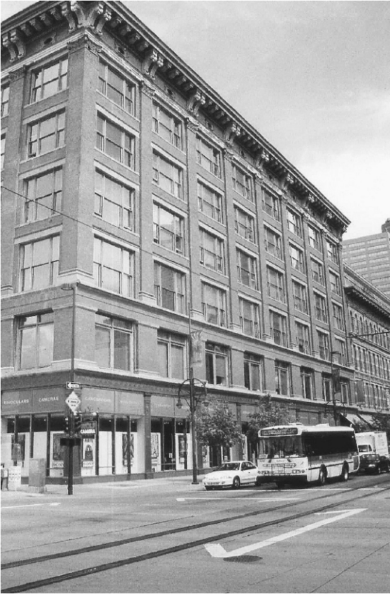
Figure 2.3. The successful reuse of existing buildings such as the Denver Dry Goods Building in the LODO district of Denver demonstrated that there is a viable market for these types of residential mixed-use projects in original urban neighborhoods that new urbanism seeks to emulate.

necessary to look at what is already built and investigate the finer grain of the community where repopulation is desired. Because the average house size is shrinking, the existing older building stock may become more attractive to people who seek more sustainable lifestyles and will trade some living space for accessibility to urban living opportunities. These buildings can be reused to foster greater density in communities that demonstrate the advantages of urban living and provide rehabilitation incentives and favorable financing instruments.