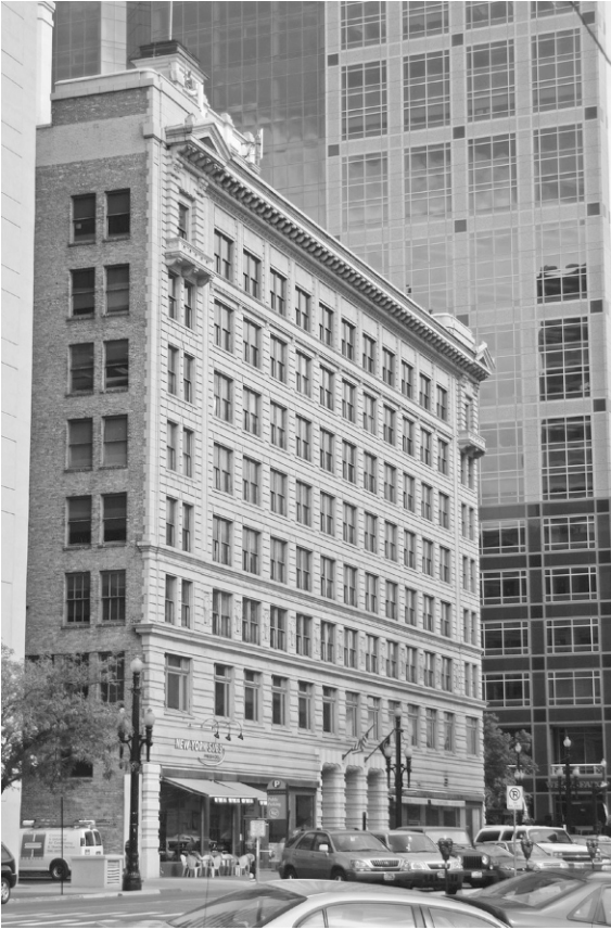
Figure 3.16. In the early twentieth century, the use of masonry (thermal mass) gave way to a greater use of curtain walls composed of aluminum or glass. Shown here in the foreground is the Clift Building in Salt Lake City, Utah, completed in 1920, and in the background is the Wells Fargo Center (originally the American Stores Building), completed in 1998.

energy conservation implications. In some cases, this thermal shift may take several hours and may help meet nighttime heating needs or be reradiated to the night sky directly or through convective flow, using natural or mechanical ventilation methods. This lack of understanding of how the R-value of masonry is tempered by the thermal flywheel effect has led to many misunderstandings about its energy performance. Conversely, materials such as aluminum, glass, and plastics may transmit heat very quickly by comparison.