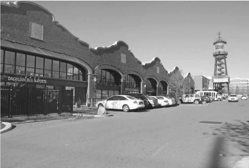
Figure 1.10. Trolley Square in Salt Lake City, Utah, converted to a shopping center in 1972, was an early demonstration that preservation could revitalize buildings and districts.

When it came to extending these ideas to the community scale, the NTHP recognized that most small communities lacked the expertise to organize the economic restructuring of their central business districts to accommodate preserving and reusing buildings effectively. Therefore, the NTHP launched the National Main Street Project, forerunner of its National Main Street Center (NMSC) program, in 1980 to provide educational and technical assistance. In addition, many states and preservation advocacy groups introduced incentives such as state tax credits, low-interest loans, and grant programs.