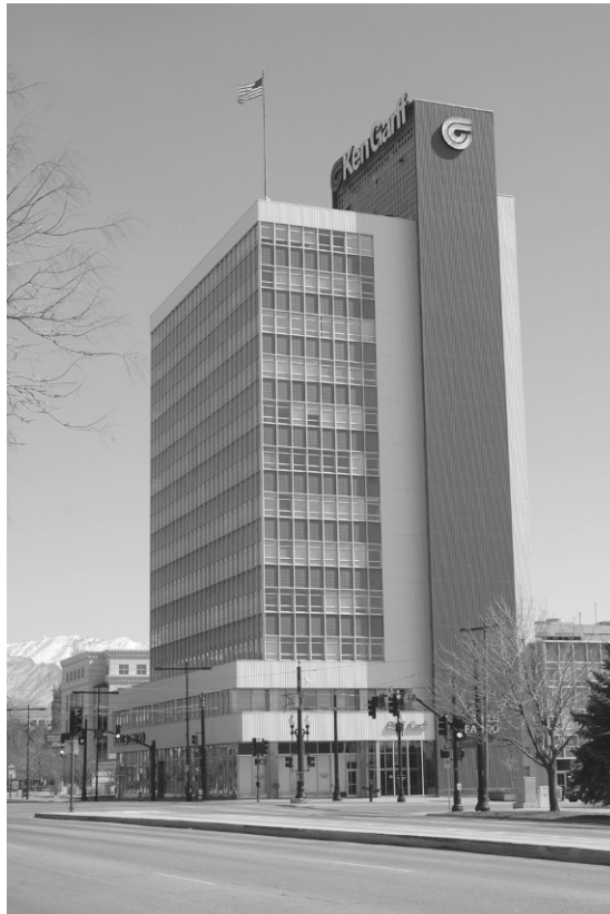
Figure 4.3. The financing for the reuse of the former First Security Bank building in Salt Lake City, Utah combined New Market Tax Credits and Historic Tax Credits.

The allocations are done annually on competitive basis. The CDFI Fund allocated $3.5 billion in the 2009 application round. This amount was supplemented by $1.5 billion from the American Recovery and Reinvestment Act (USTREAS 2009). Overall, the CDFI Fund is authorized to allocate tax credit authority to support investments, in the aggregate, of $26 billion (USTREAS 2010a). Additionally, NMTCs can be combined with HTCs that are not used for residential purposes (fig. 4.3), with the exception of hotels, which are considered a commercial activity.