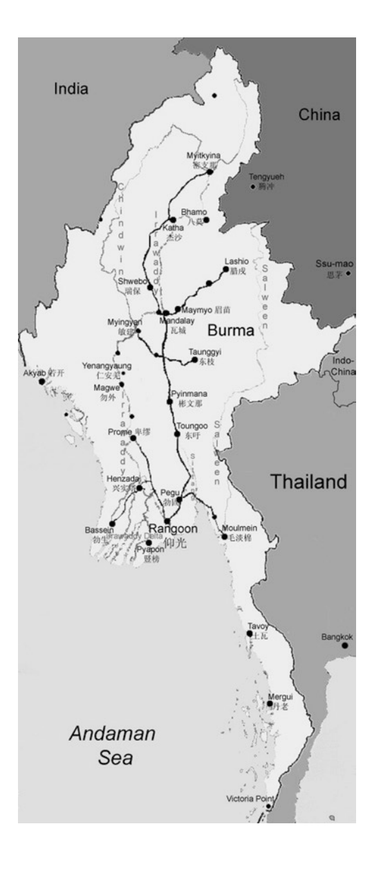
Map 1 Illustrative map of colonial Burma