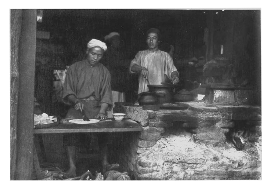
Fig. 2.2 A Baker's Shop in the Chinese quarter of the town. It is not perhaps a very inviting place, nevertheless the bread made in Mandalay is exceedingly good (Photograph by Willoughby Wallace Hooper, 1886. © British Library Board, Photo 312/(83))

The establishment of associations like this was more than a continuation of pre-colonial community-building activity. Under the changing administrative system in Upper Burma, the Yunnanese responded with the development of temples, burial lands, associations, and schools for the community, through which an increasingly clear image of ethnic Chinese could be recognized in order to differentiate itself from its non-Chinese neighbors. Such clarification was necessary for them to fit into ethnic pigeonholes allocated by the colonial ethnographic infrastructure. There was no more space for ambiguity. As colonial subjects, they needed to tick the boxes, choosing from indigenous races, Indian castes, or other Asiatic migrants, limited options that were clearly defined in the census and other government documents. Under this classification system, the Yunnanese had no other choice but to become part of the Chinese migrant community (Fig. 2.2).