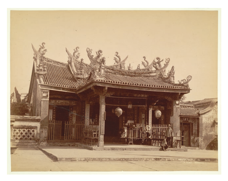
Fig. 3.2 Chinese Temple [Rangoon] (Photograph by Philip Adolphe Klier, 1895. © British Library Board, Photo 88/1 (18))

negotiations with the government, and a compensation of 7950 Rupees paid on January 6, 1909, the warehouse was demolished.<sup>66</sup>