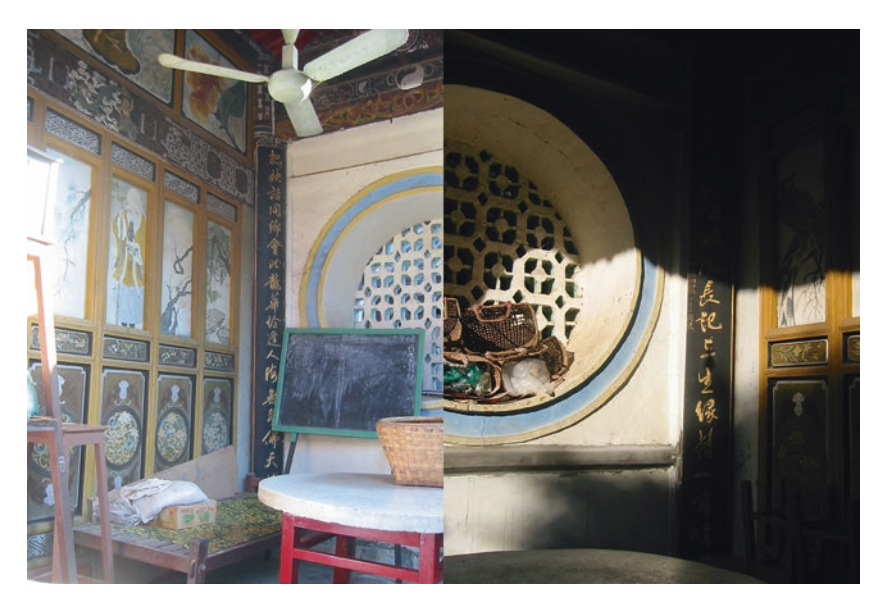
Fig. 6.1 Couplet by Kang Youwei, courtyard of the Yunnanese Guanyin Si , Amarapura, near Mandalay, 2008

Those accompanying me are all my compatriots. Our meeting is like a Buddhist assembly: no conflict with the mundane world, and both the Buddha and the Heaven are delighted;