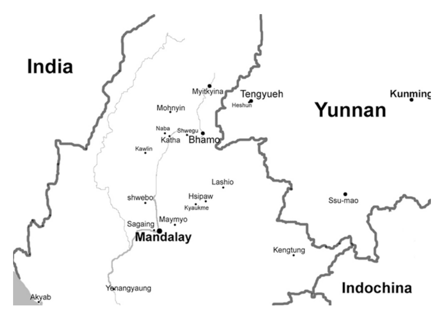
Map 2 Illustrative map of western Yunnan and upper Burma