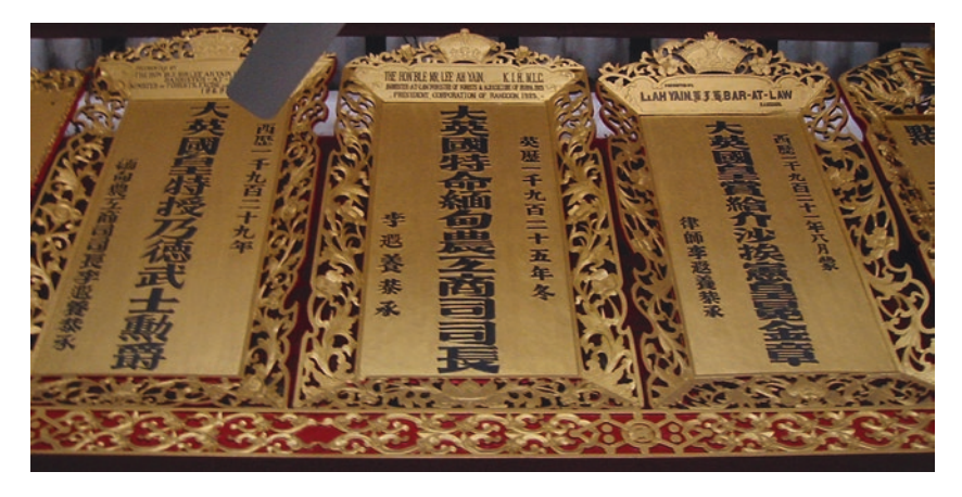
Fig. 6.2 Honorary banners for Lee Ah Yain inside the Cantonese Lee Clan Hall, Yangon, 2008

However, beyond Chinese quarters, the atmosphere was not that favorable to Lee Ah Yain. "The tentative honeymoon under diarchy was quickly over,"<sup>87</sup> at least after the 1925 election, when the opposition parties were unable to maintain a majority in the second Council.<sup>88</sup> With the Nationalist faction in the government diminished and its internal confusion increased, and the tension between Burman and non-Burman members intensified,<sup>89</sup> Lee Ah Yain's appointment was predictably a hotly debated issue throughout the second Council. Almost immediately after his appointment, a no-confidence motion was put against Lee in the Council, denying him ministerial salary by the leader of the Home Rule Party, U Pu (Toungoo South). It was backed by U Ba Pe of the Nationalist Party and Tun Win of the Swaraj Party. All three parties belonged to the Nationalist bloc in the Council. Albeit claiming an amicable relationship with Lee Ah Yain, they were critical of his political capability. One Anglo-Indian member claimed: