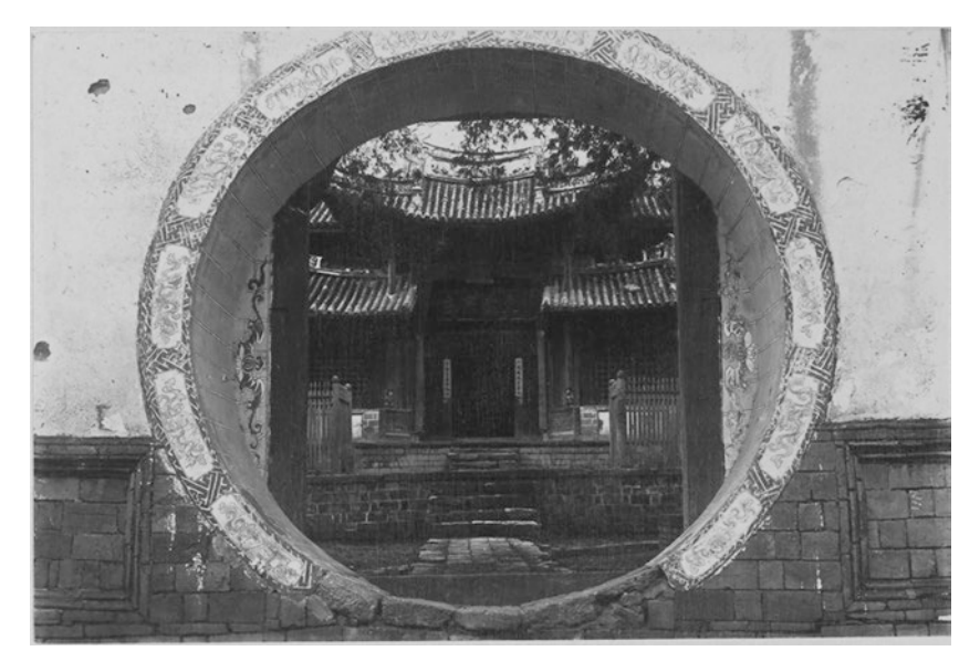
Fig. 2.1 Doorway of a Chinese temple, Bhamo

fashion adopted in Chinese temples. The theatrical stage is over the entrance to the second court, and faces the religious part of the building, which, in its turn, is raised above the court immediately below it. The court of the sanctuary has a covered terrace round its three sides with recesses off two of them, containing seated figures nearly life-size, with rubicund, almost fiery faces, having black beards and moustaches of formidable cut and dimensions. They are all, in accordance with a Chinaman's just appreciation of the value of rupees, carefully protected from dust and injury by being placed in square boxes, which I ought to dignify with the name of shrines, closed in front with almost opaque, gauze netting. A few priests live in a court-yard at the side of the building which is built entirely of brick, and after the Chinese grotesque idea of architectural beauty.<sup>47</sup>