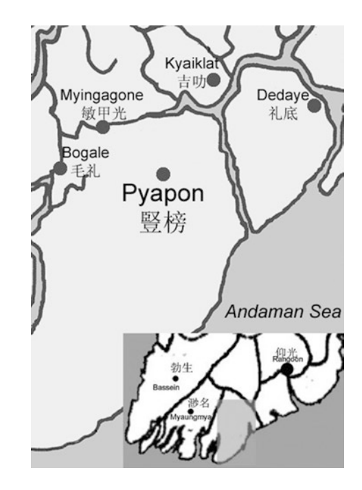
Map 3 Illustrative map of Pyapon and its surrounding area