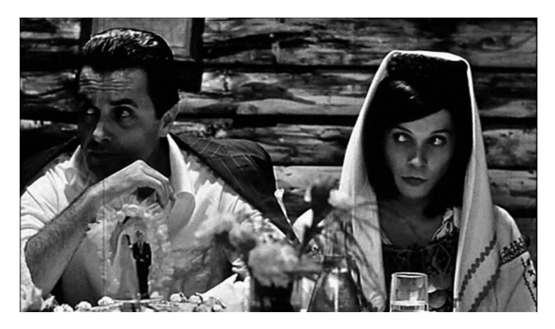
Figure 3.3 A "traditional" queer wedding (Go West, screen grab)

between the performance of sexual/gender identity and the construction of normative ethnicity during the times of violent wartime upheaval. Yet nevertheless, that statement by Kenan reiterates the problematic notion of the violently backwards Balkans, especially when the context of its utterance is taken: a Paris-based talk show intended for the sympathetic Western European audiences. Indeed, the film trades in stereotypes to arrive at its adulterated critique of nationalist madness. Its conventional film language, however, largely cannot sustain effective envisioning of queer desire (Figure 3.3).