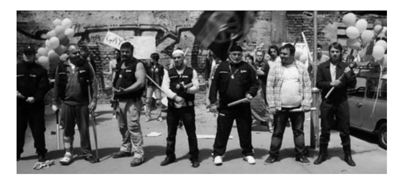
Figure 3.4 A trans-ethnic security detail ( Parade , screen grab)

and helps Mirko organize the Pride, thereby admitting that Mirko's belief that a fight for greater visibility might be an important step, during the actual Pride the group is violently attacked by hooligans, and even though the security detail does their best, they are not able to defend everyone. Mirko—the greatest proponent of the Pride and the most activist-minded queer character in the film—is the one who gets beaten the most and dies as a result. Thus, he is punished for his belief in the importance of visibility and pays the ultimate price. And yet again, the queer couple ends tragically in order to serve as a device of social critique. In the end, we see Radmilo carrying Mirko's picture and proudly walking in a much bigger Pride, together with Limun and his fiancé, and the implication seems to be that Mirko did not give his life for nothing, and that visibility is being achieved after all.