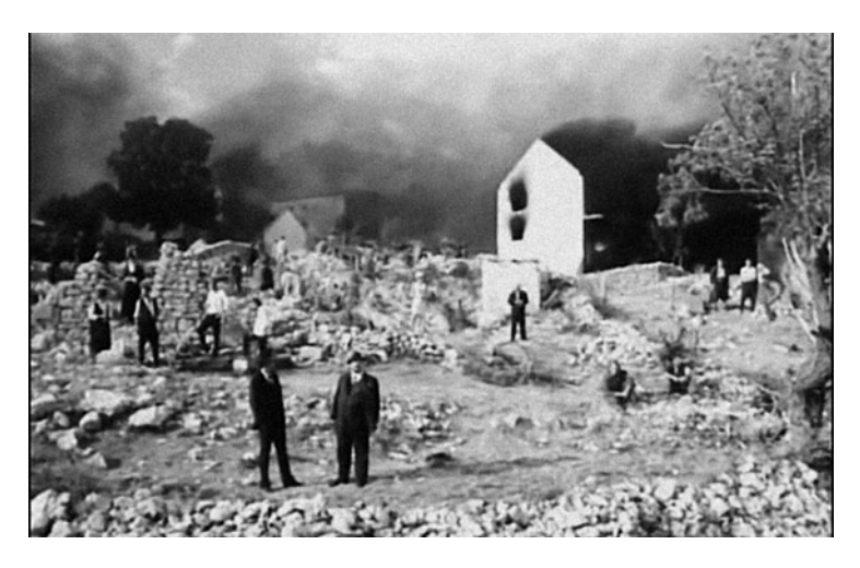
Figure 4.2 Ancient hatreds or the return of the repressed? ( The Knife , screen grab)

place. It is safe to say that there is an ethical responsibility that is being neglected altogether within the frames of these films, as re/creating an external threat, past and present, is posited as the primary organizing principle of belonging collectively. In the section that follows, I discuss in detail another example of a heritage film, but one whose political implications are not as involved with the feeling of a threat from an ethnic/external Other as much as they are invested in the feeling of an internal threat to the nostalgically envisioned traditional ways of life.