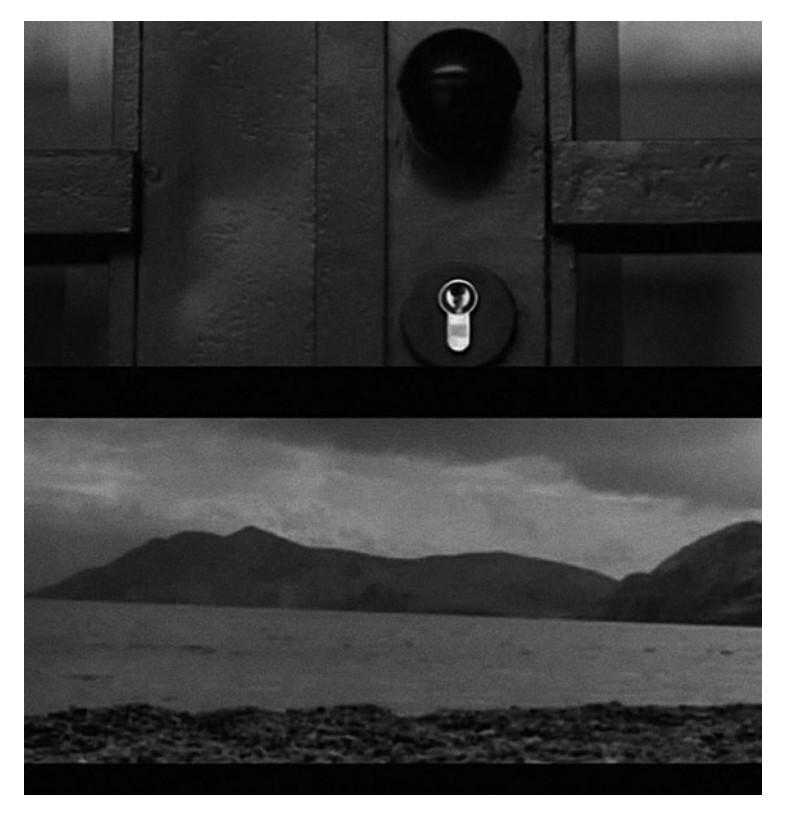
Figure 3.1 The iron door closes, and the screen returns to a queer time and place ( Fine Dead Girls , screen grab)