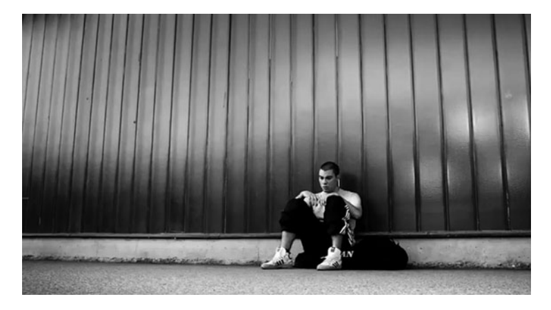
Figure 5.3 An immigrant youth subculture and disavowal ( Southern Scum Go Home! screen grab)