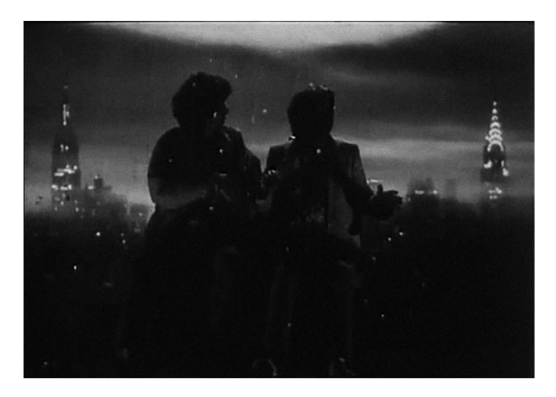
Figure 1.3 Levitating in diaspora (Someone Else's America, screen grab)

Finally, if we were to envision the spectator the way Dubravka Ugrešić envisions a reader, the following words might apply: