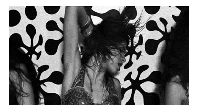
Figure 5.2 Club cultures and the habitus of postmemory (Clip, screen grab)

boys and girls. While the boys in Tilva Ros work within the limited set of dispositions inherited from their working-class belonging, they reimagine the space around them and rearticulate the existence of both the controlling gaze and of the postmemory of pain and injury into a legitimate self-expression of subcultural agency. For the girls in Clip , however, that re-envisioning seems to be firmly locked within the framework of patriarchal vision that objectifies them, effectively confirming that a gendered imbalance of power still feeds the discourses of class, sub/cultural belonging, injury, and even postmemory. For what the girls inherited through the habitus of postmemory, if we can call it that, is an understanding that a performance of exaggerated femininity is a means (perhaps their only means available to them) to perform the ascendance of the class ladder (Figure 5.2).