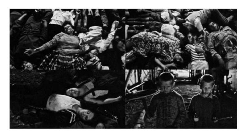
Figure 2.1 The sequence that marks the return of the repressed ( Pretty Village Pretty Flame , screen grabs)

The film's incessant, circular calling attention to the dynamics between conscious and unassimilated memories, which interrupt one another by blurring the lines between different temporal frames, makes it difficult to delegate Pretty Village Pretty Flame into a firmly and unambiguously ethno-nationalist frame of address. When traumatic memory is