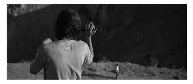
Figure 5.1 Multiplying visions ( Tilva Ros , screen grab)

would tack onto their experiences. This stylistic approach makes the viewing of Tilva Ros into an experience of embodied immediacy as opposed to a performance of detached observation (Figure 5.1).<sup>10</sup>