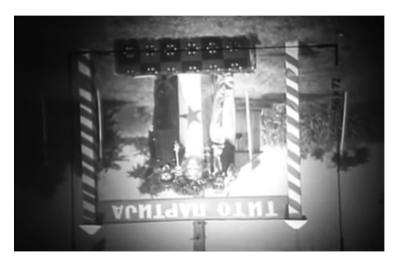
Figure 4.1 The staging of the upside down scene ( Three Tickets to Hollywood , screen grab)