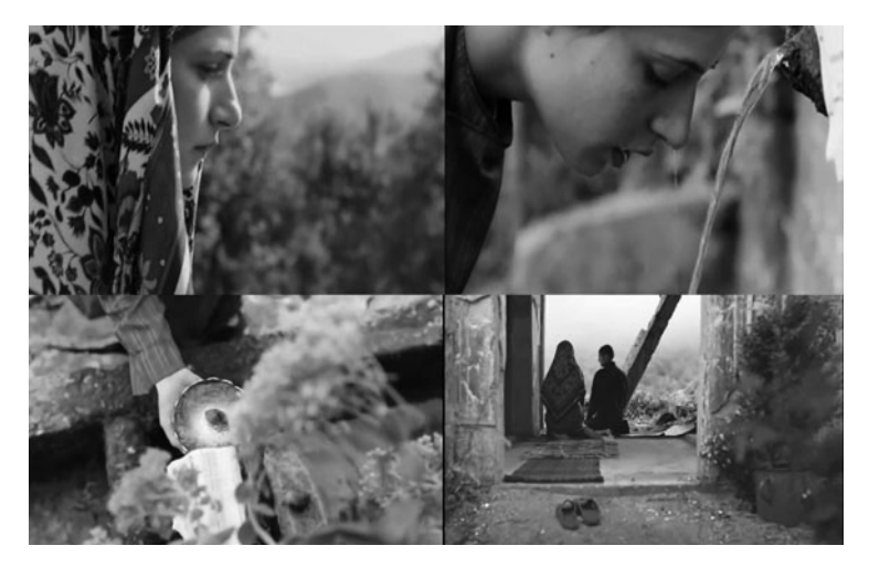
Figure 2.4 Dream, repetition, melancholia (Snow, screen grabs)

to understand it as an artifact that is rendered meaningful in many different ways through embodied practices of the women who wear it. Mima Simić is critical of the film's "re-patriarchalization" of its heroine through her choice to cover her head (197). However, I want to suggest that this act can be read as re-patriarchalization only if the headscarf is understood to be, inherently and inalienably, a tool of women's submission under patriarchy, an external sign that she has internalized her oppression—an assumption that I find troubling and simplistic. Contrary to this interpretation, I see the headscarf in Snow as Alma's externalized and self-imposed mechanism of coping, most pronounced in her recurring dream—a symbol of soothing comfort that protects her body from being exposed to pain by retuning it to the simple and reassuring routine of everyday life (Figure 2.4).