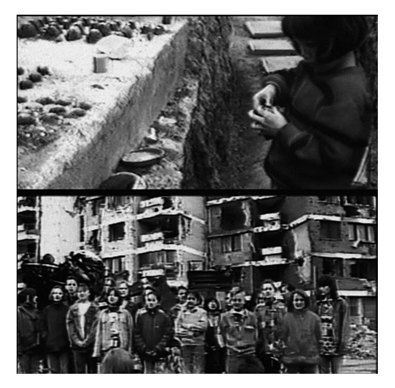
Figure 5.4 Video-flashbacks of trauma ( Children of Sarajevo , screen grabs)

a different shape that reflects the ways trauma lodges itself within physical existence.