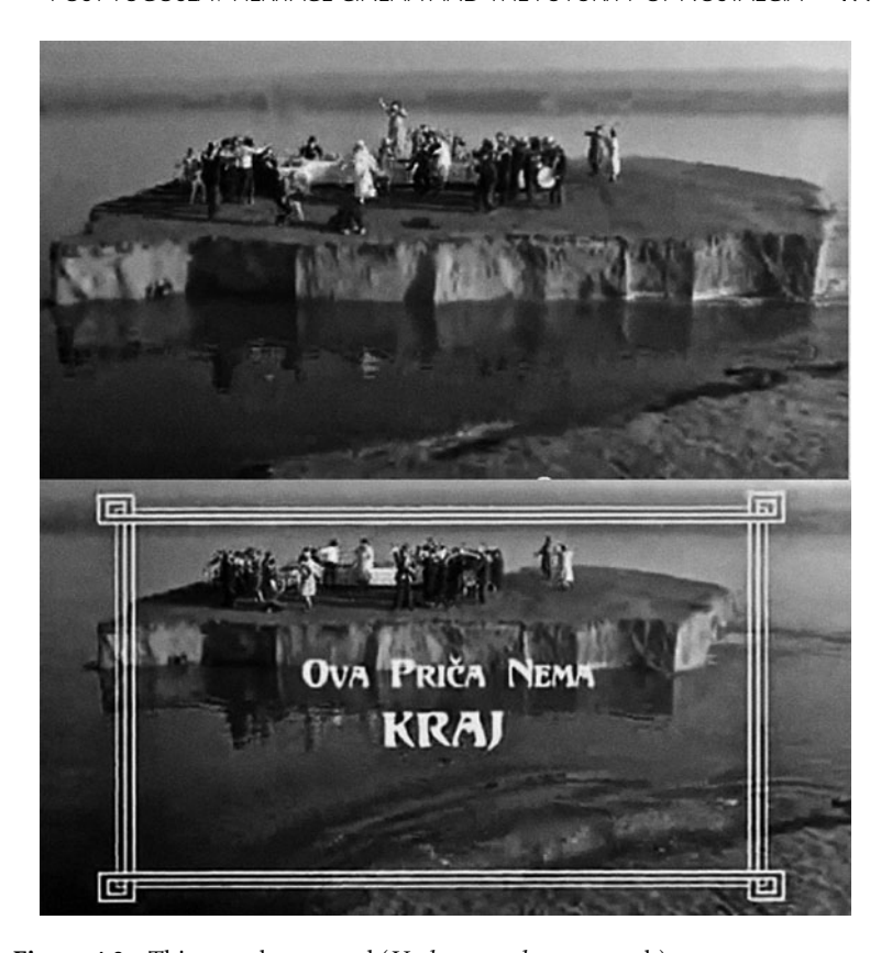
Figure 4.3 This story has no end ( Underground , screen grab)