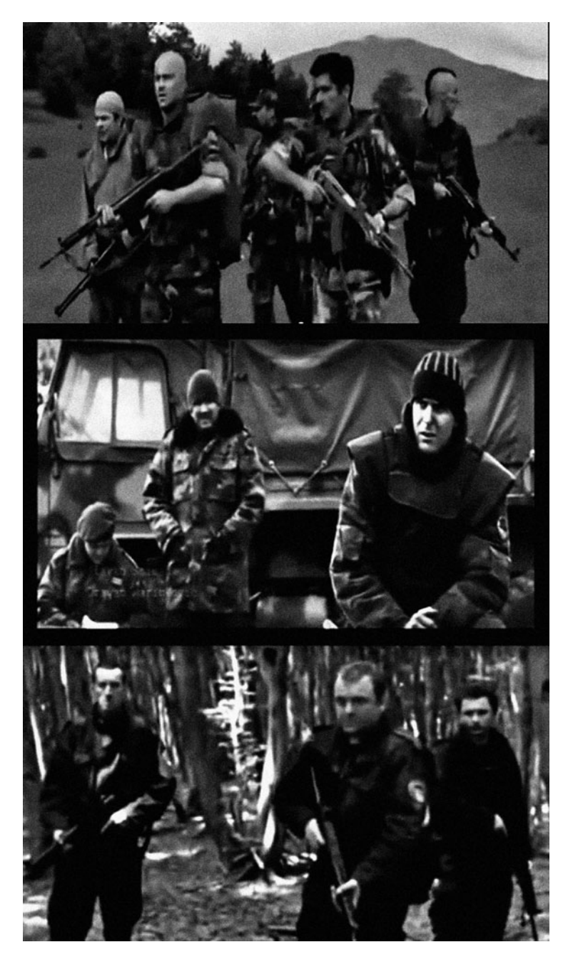
Figure 1.2 Warring masculinities, perpetrator trauma, and genre overtones ( The Living and the Dead, The Enemy, The Blacks , screen grabs)