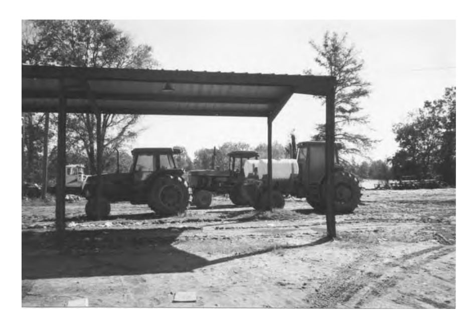
Figure 3.5 Tractors