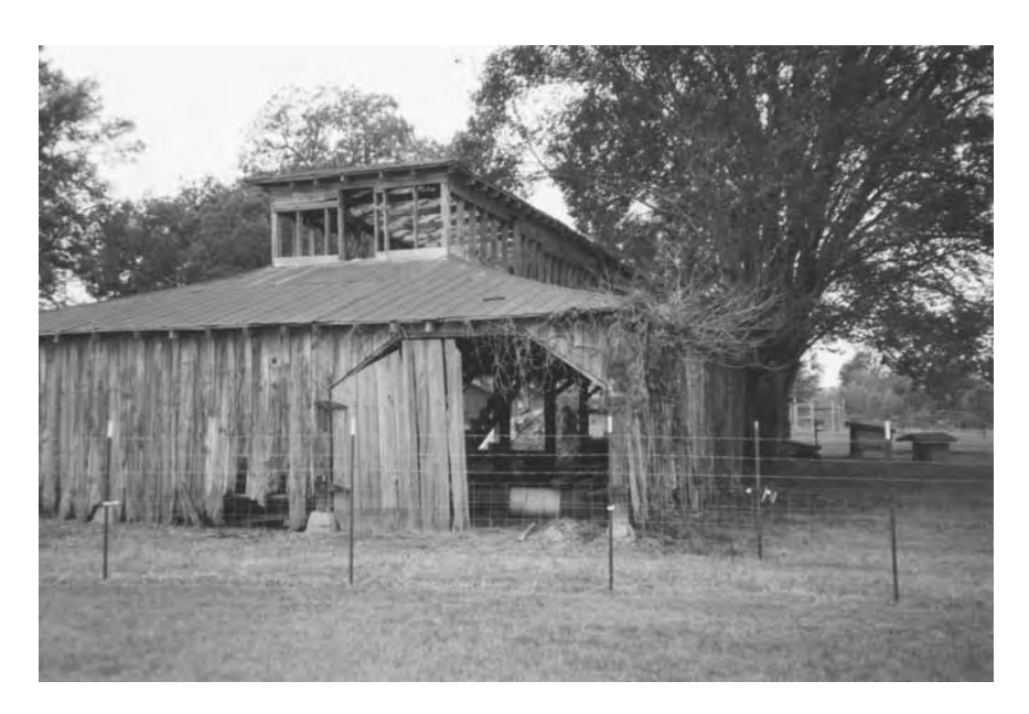
Figure 3.4 Barn, the Delta