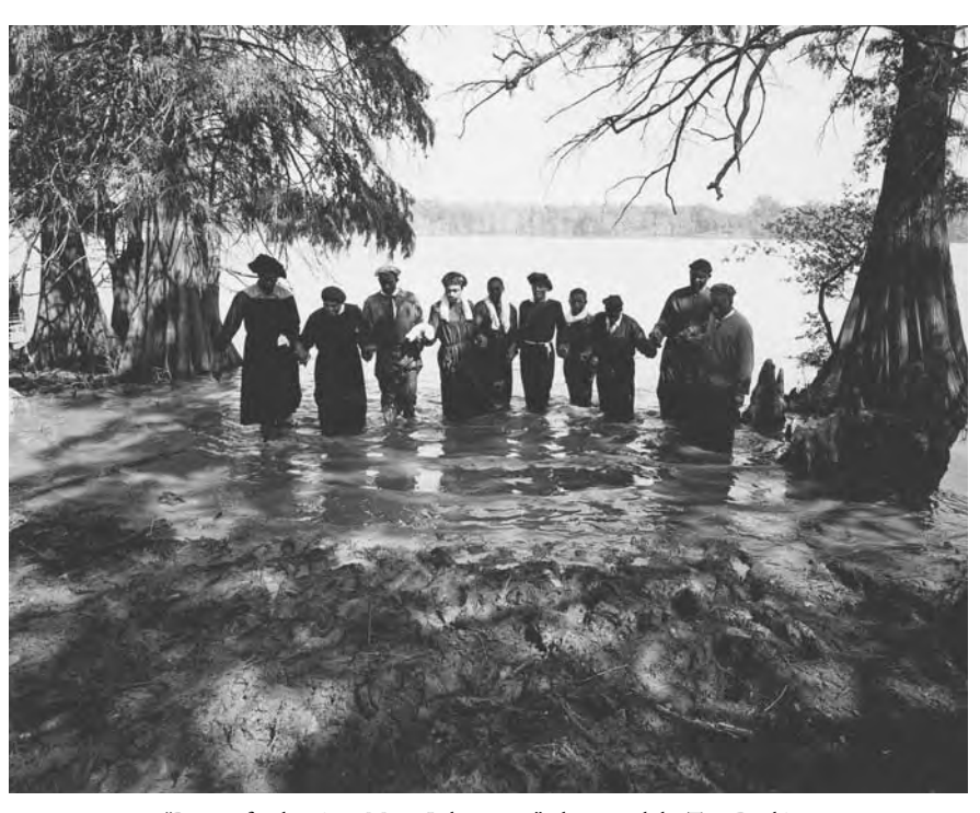
"Prayer after baptism, Moon Lake, 1990," photograph by Tom Rankin