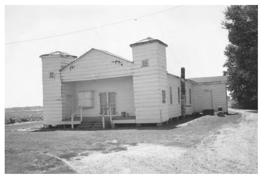
Figure 2.1 Rural Church, Delta