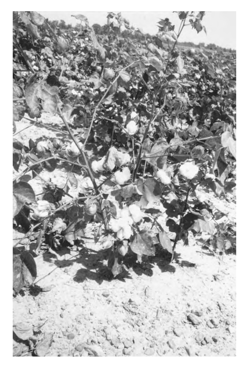
Figure 3.1 Cotton crop

and a bank. The national depression of 1921–1922 was particularly hard on cotton farmers throughout the South, and many of the black farmers in the areas surrounding Mound Bayou fell into debt, tenancy, and sharecropping. Nevertheless, from Renova, north and east of Cleveland, through Winstonville, north of Mound Bayou, many black farmers owned considerable amounts of land.